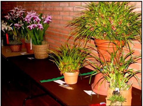
Several Maxillaria tenuifolias