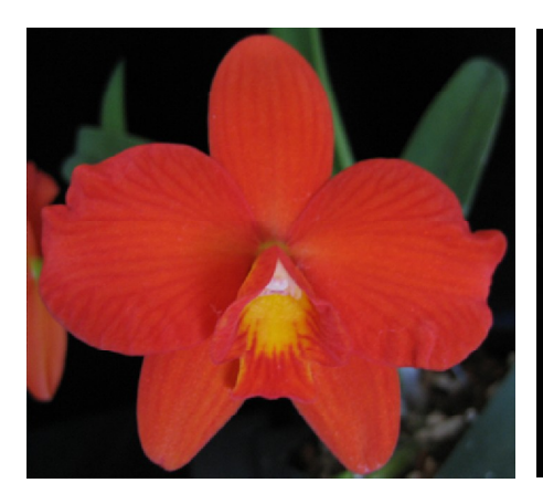
Slc. Red Jewel 'Orange Kiss'