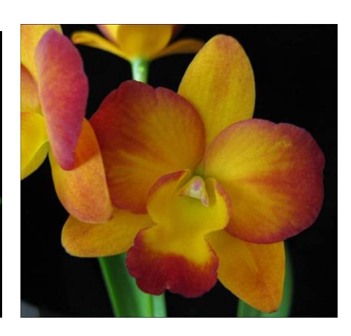
Hwksa. Keepsake x Blc. Love Sound