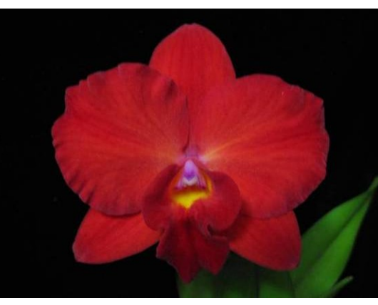
Slc. Bright Circle 'Cherries Jubilee' (Slc. Bright Angel x Slc. Circle of Life)