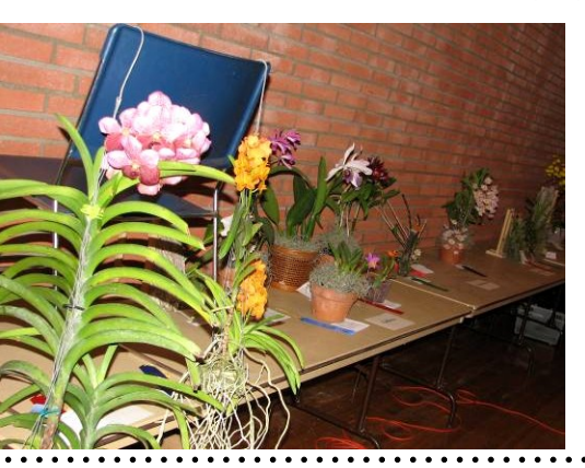
Member Orchids on the Judging Table above and below

Mini-Catt pictures can be found in the email-version of this news-letter which is on our website.