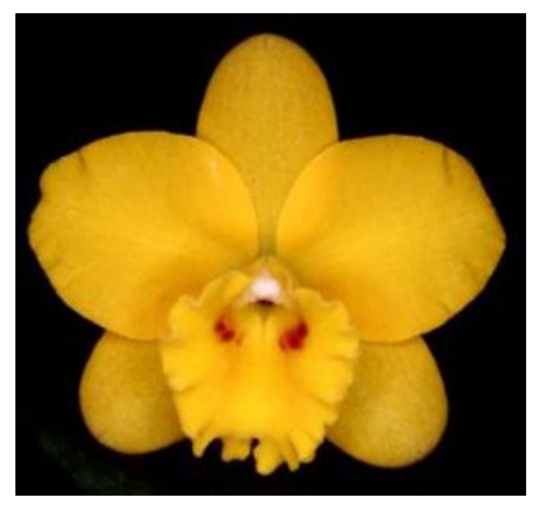
Sc. Beaufort 'Big Circle' HCC/AOC (Soph. coccinea x C. luteola)