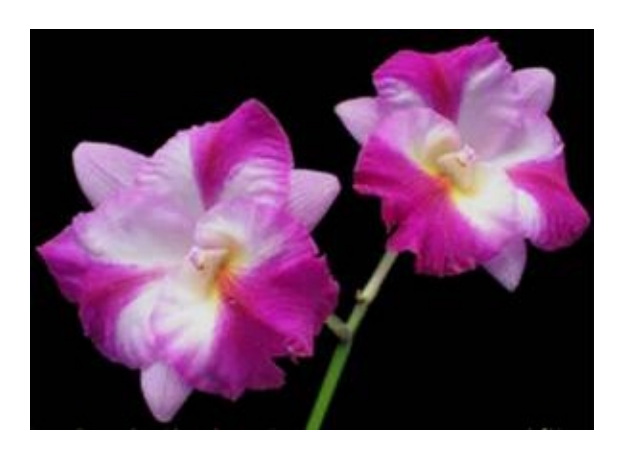
Lctna. Peggy San 'Gold Country' (Lc. Peggy Huffman x B. sanguinea)