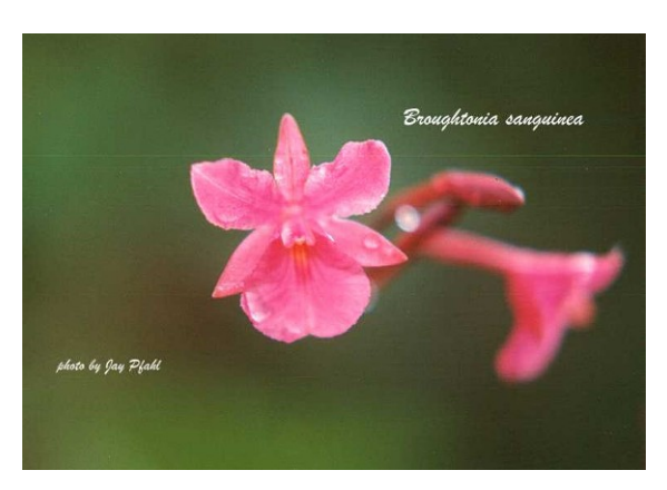
Broughtonia sanguinea