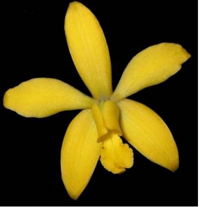
Laelia briegeri