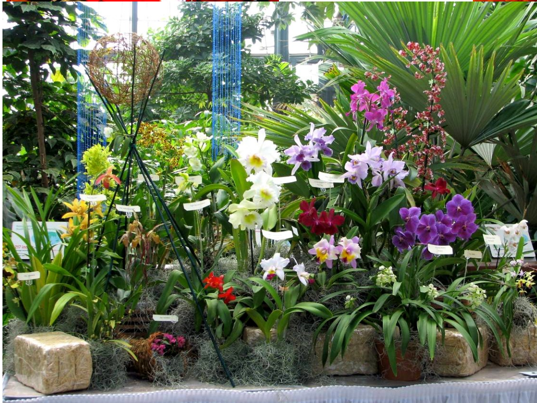
2008 Southland Orchid Show