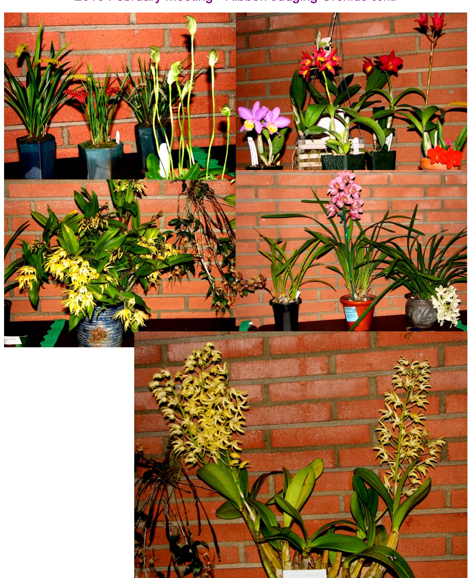
2010 February Meeting - Ribbon Judging Orchids cont.