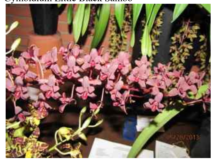
Cymbidium Little Black Sambo