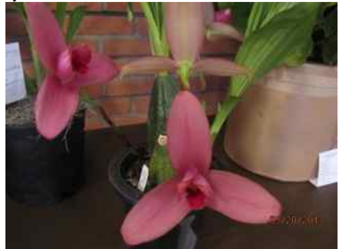
Miltoniopsis Echo Bay 'Midnight Tears'