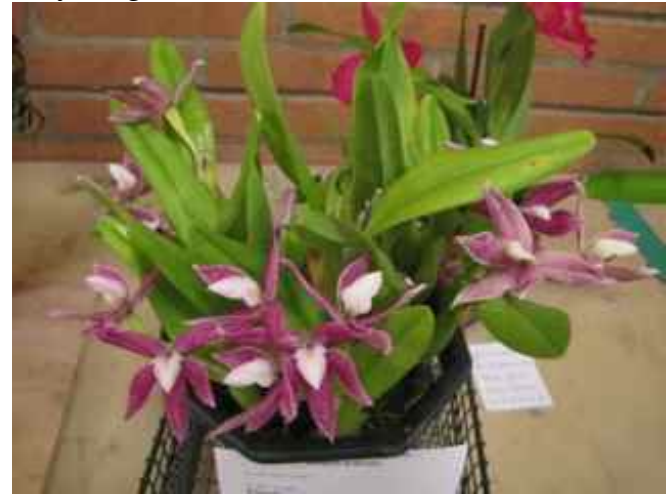
Neofinetia falcata x Sedirea japonica