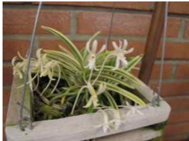
Cymbidium Golden Elf 'Sundust'