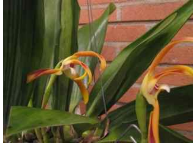
C. intermedia x C. skinneri