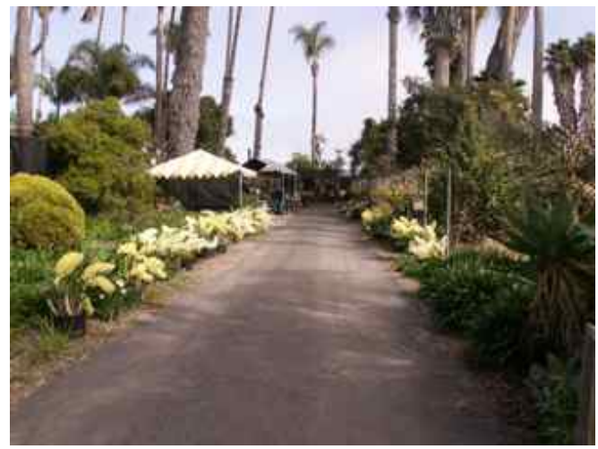
SBOE on Thursday, ready for the crowds

Below are just a few of the many spectacular sights and flowers one can see on this fabulous spring weekend. You may want to consider a mini vacation next year at this time.