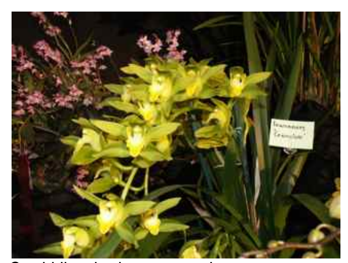
Cymbidium lowianum concolor