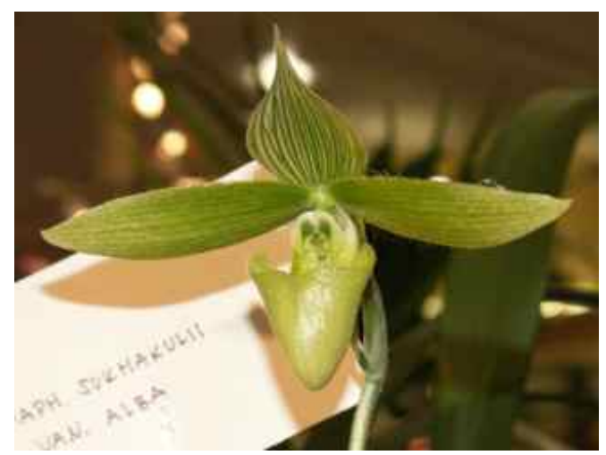
Paphiopedalum sukhakulii var. alba