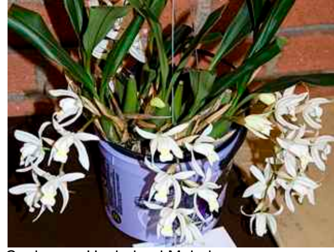
Coelogyne Unchained Melody