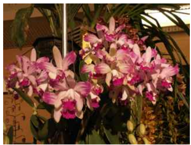
Cattleya intermedia aquinii (peloric)