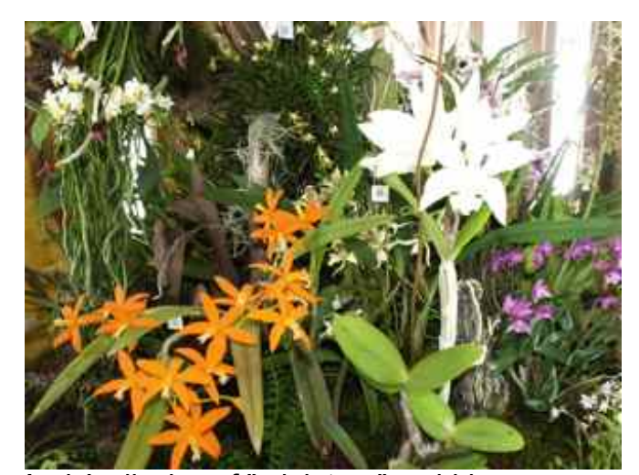
Andy's display of "miniature" orchids