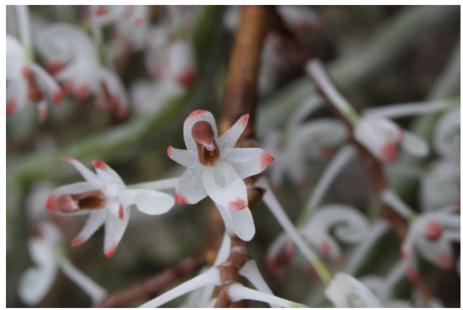
Microcoelia aphylla 'Rocky' AM/AOS 80 pts. Exhibited by Alfred Hockenmaier