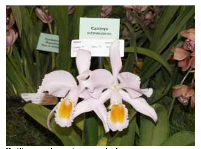
Cattleya schroederae pale form