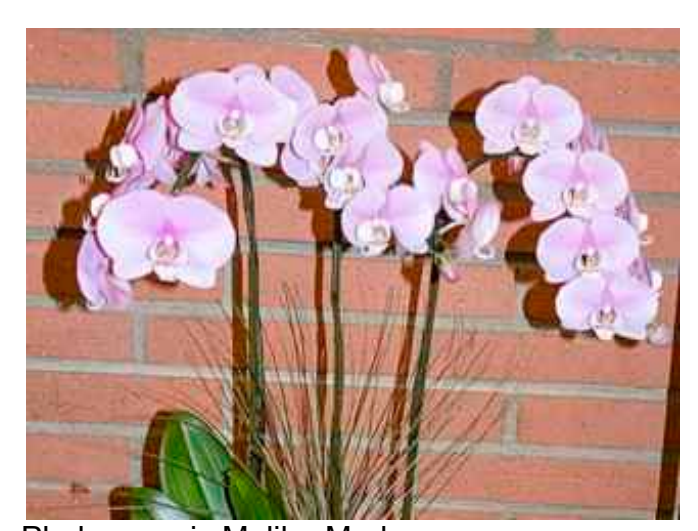
Phalaenopsis Malibu Madonna