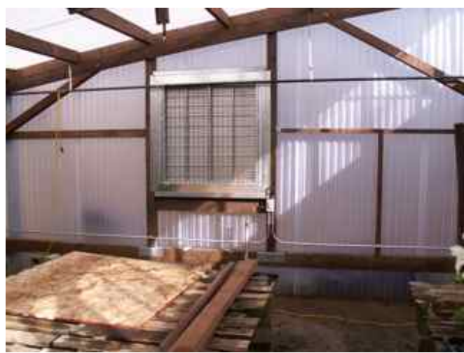
New walls (and lots of orchids) at Cal-Orchid