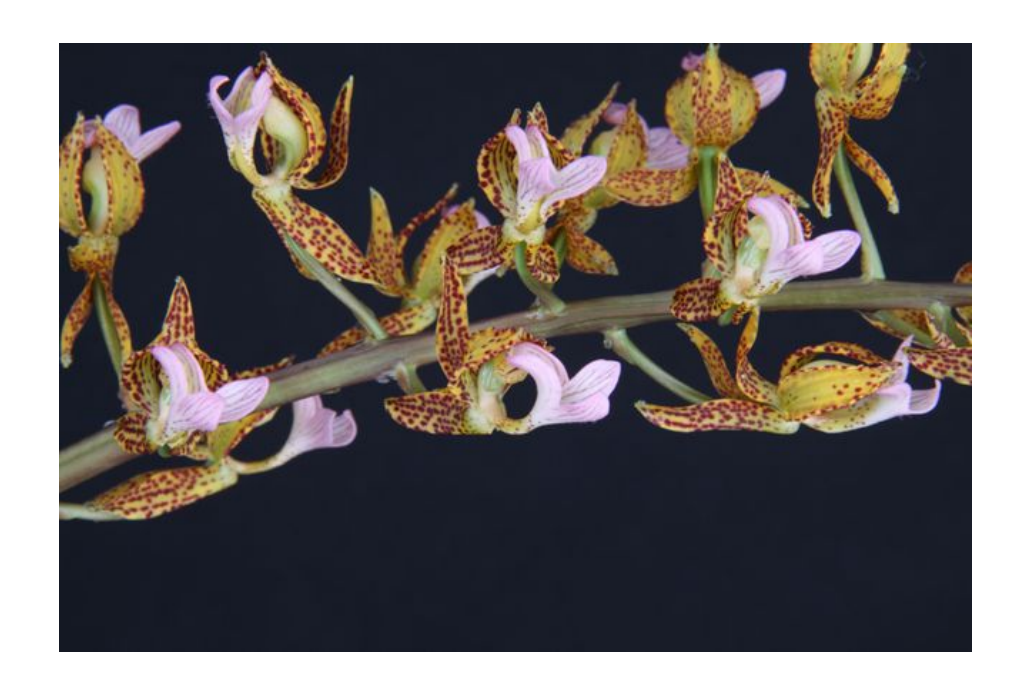
Mormodes welterianum 'Baker's Mini Butterfly' AM/AOS 80 pts. Exhibited by Brent Baker