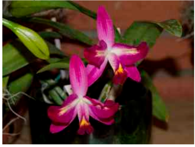
Phal. equestris 'Rosa'