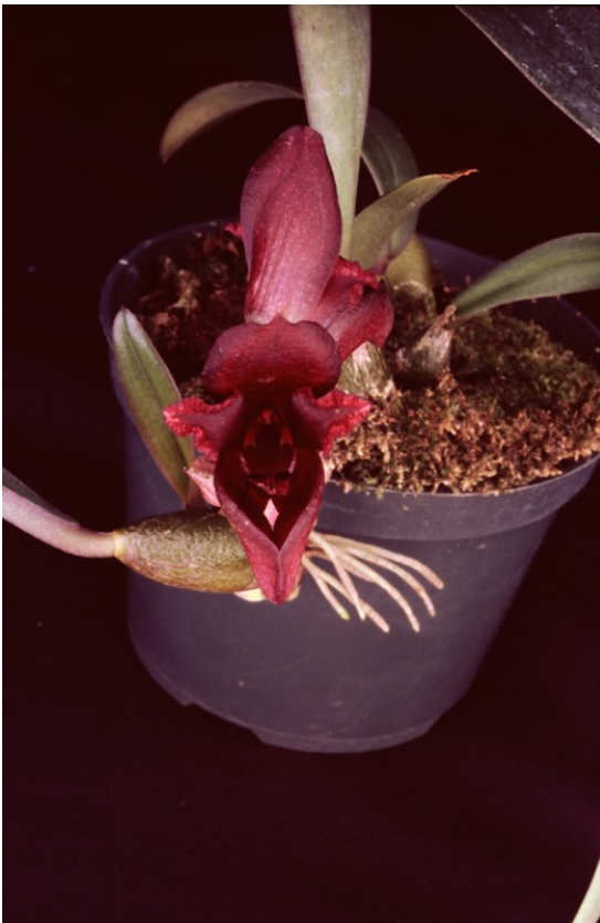
Bulbophyllum cruentum 'Giok Tien Gan'