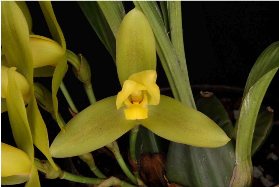
Lycaste Corrimal 'Dene' AM/AOS 81 pts. Exhibited by Carol Beule