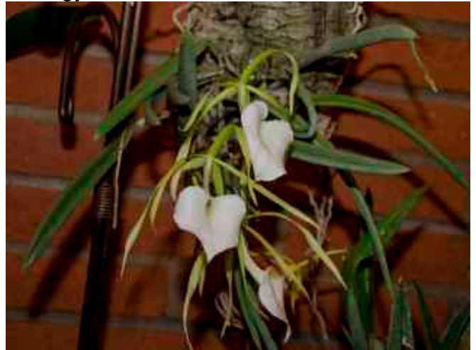
Brassovola nodosa 'Susan Fuchs' FCC/AOS