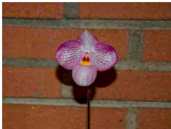
Paphiopedilum Magic Lantern