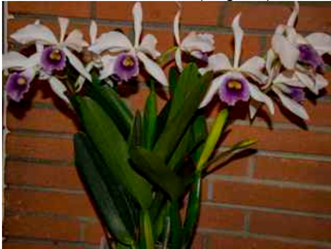
Lc. CG Roebling