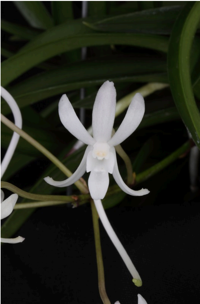
Vanda falcata 'Perfection'