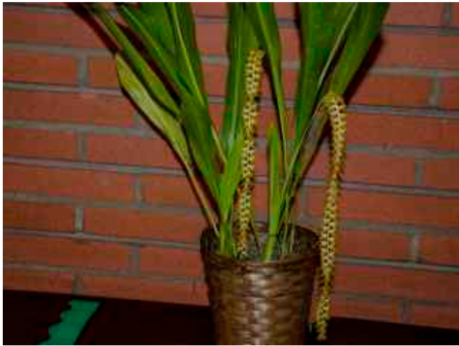
Dendrochilum macranthum (magnum)