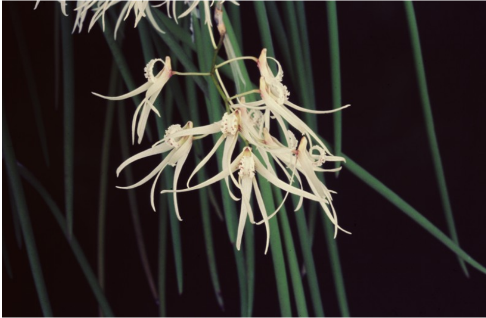
Dendrobium teretifolium 'White Angels'