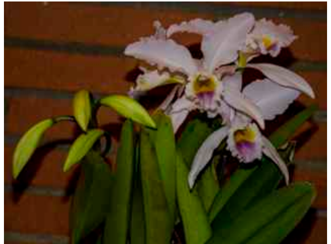
C. Gaskell Mossiae 'Blue Dragon'