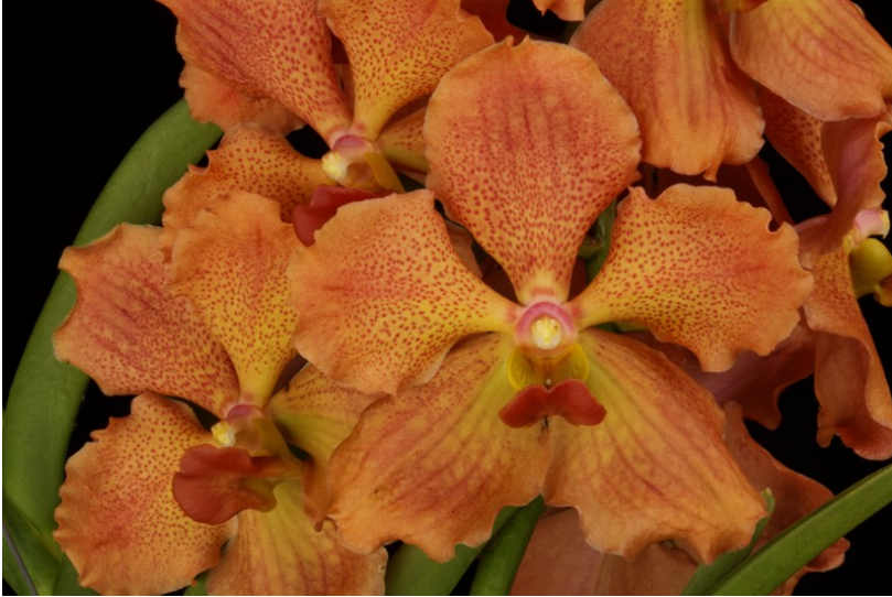
Vanda Nonthaburi 'Vantastic'