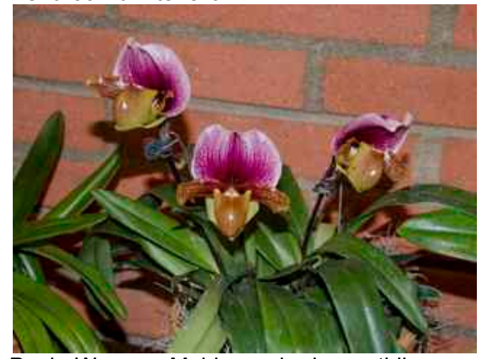
Paph. Wawona Maiden x charlesworthii