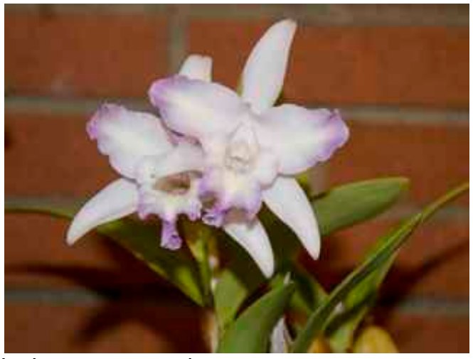
Lc Interceps coerulea