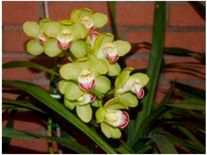
Cym. High Sierra 'Green Glory' x Pure Love