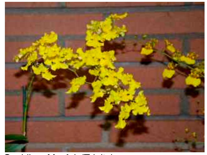
Oncidium Mayfair 'Trinity'