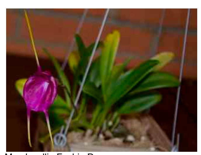
Masdevallia Fuchia Dawn