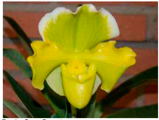
Paph. Coro Beauty