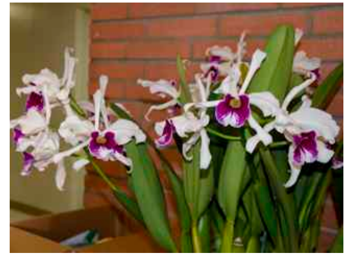
Cattleya (Laelia) purpurata v. semi-alba

Thanks to our members for the wonderful flowers and informative demonstrations.