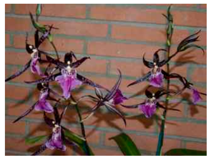
Pacific Bright Star 'Willy Nilly'