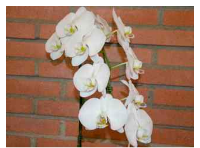
Phal. Sozo Yukidian