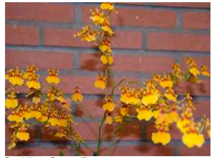
Oncidium Gower Ramsey