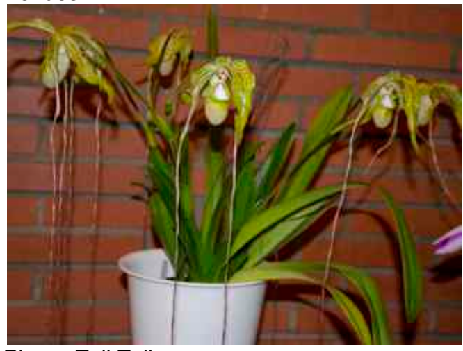
Phrag. Tall Tails