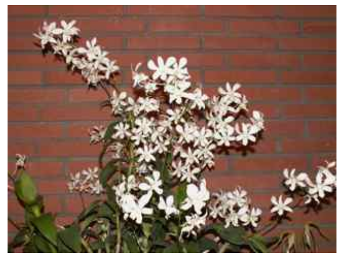
Dendrobium White Stone

Thanks to our members for the wonderful flowers.