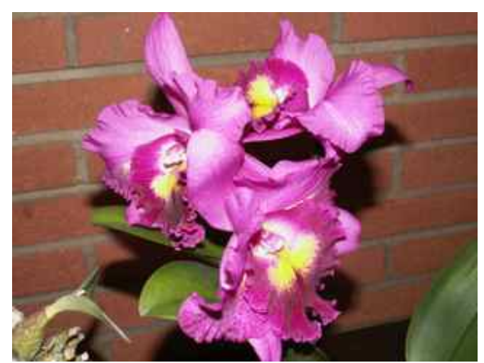
Chz. Hsinging Pink Doll 'Hsinging'