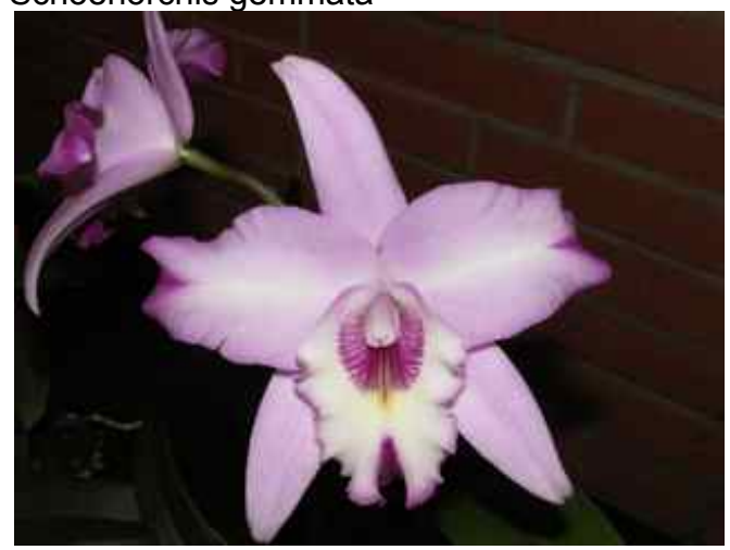
Lc. Miss Wonderful