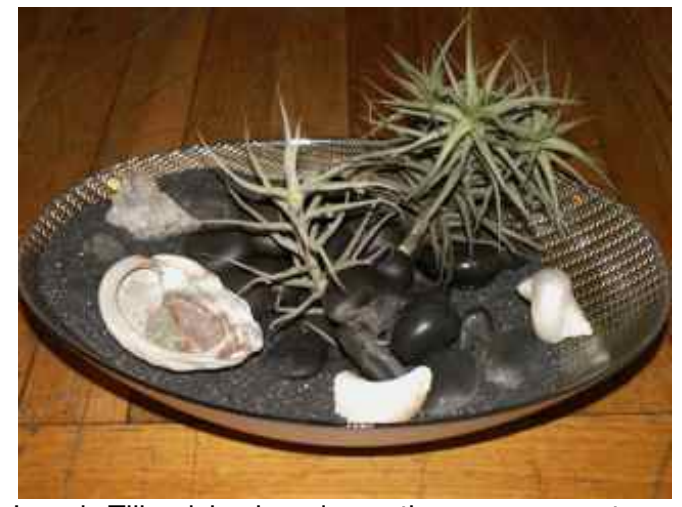
Larry's Tillandsias in a decorative arrangement