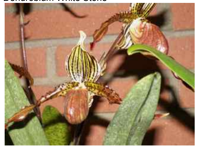
Paphiopedilum Red Baroness