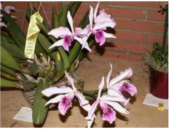
Laelia purpurata (aco x venosa striata)