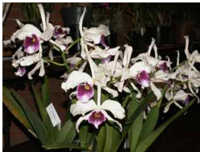
Cattleya purpurata var. semi-alba