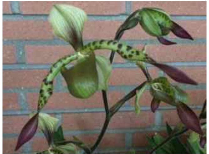
Paph. Linda Bell