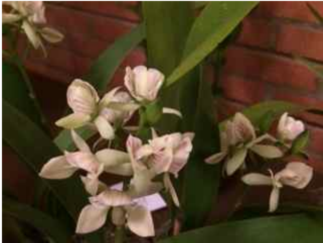
Prosthecia (Encyclia) radiata