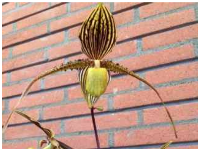
Paph. St Swithin