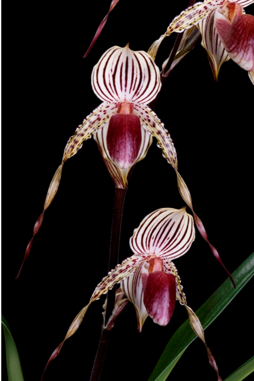
Paphiopedilum Lady Booth 'Sunset Valley Orchids'