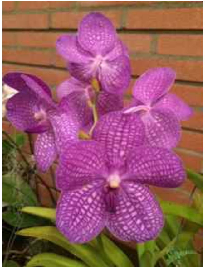
Vanda Princess Mikasa