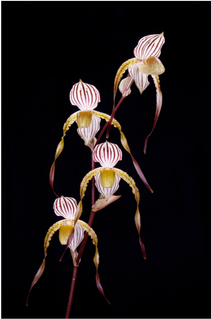
Paphiopedilum Krull's Magic Touch 'Sunset Valley Orchids'