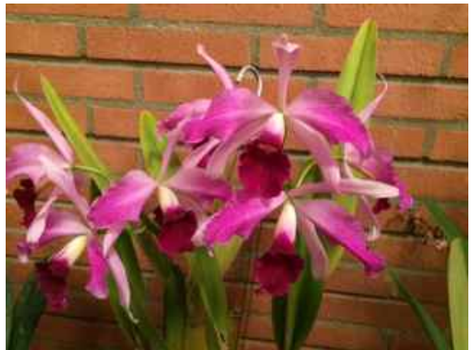
Laelia purpurata var. rosea flamea