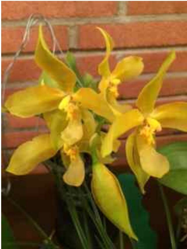
Rossioglossum schlieperianum var. aurea