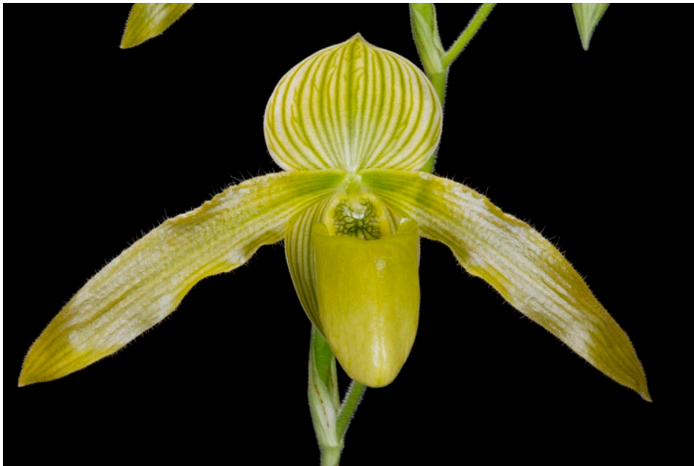
Paphiopedilum Recovery 'Sunset Valley Orchids'