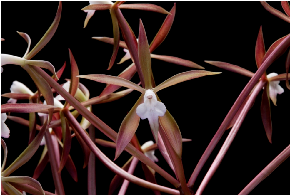
Epidendrum lacustre 'Wow Fireworks'