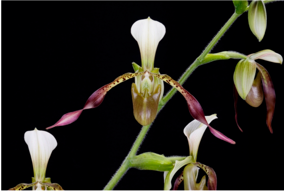
Paphiopedilum Bengal Lancers 'Huntington's Jade'