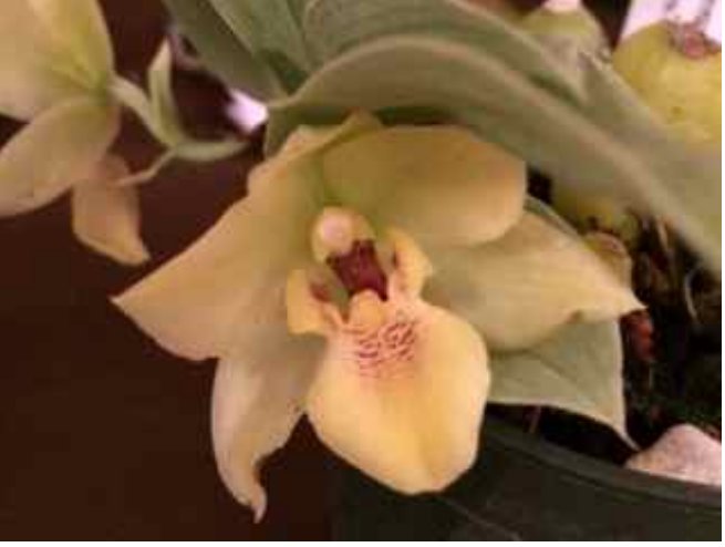
Promenaea (Limelight x Crawshayana 'Springtime')