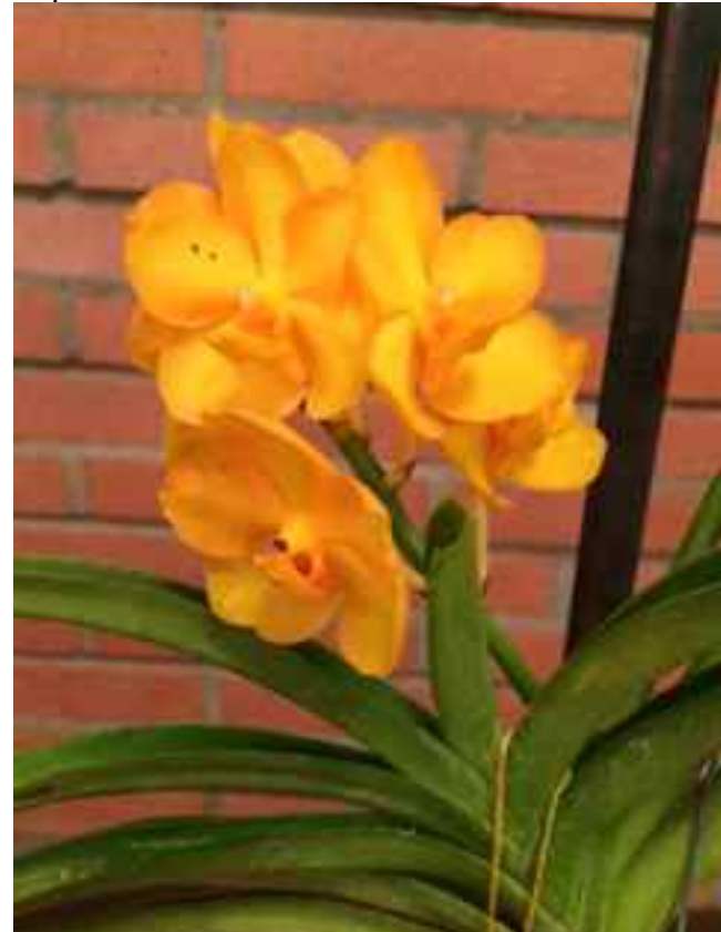
Ascda. SW Starlight