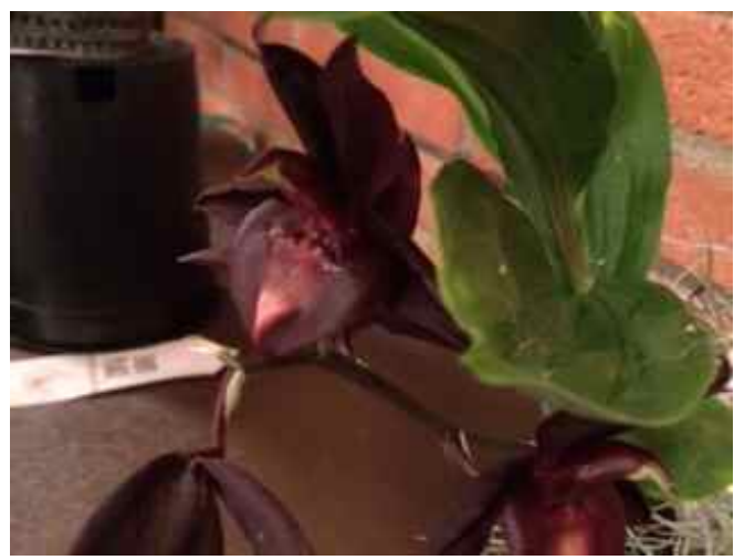
Cstm. Ten Dragons x sib