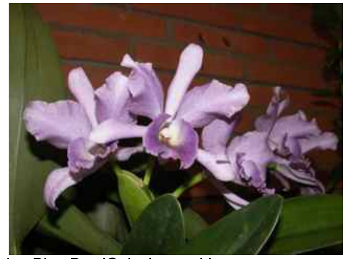
Lc. Blue Boy 'Gainsborough'