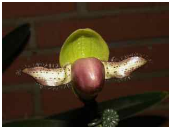
Paphiopedilum (Pinocchio x sib)