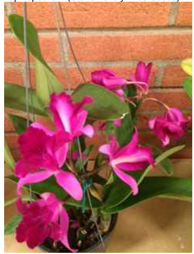
Lc (Rosette Warbud x C. Chocolate Drop)

Paphiopedilum (Stone Lovely x Ice Castle)