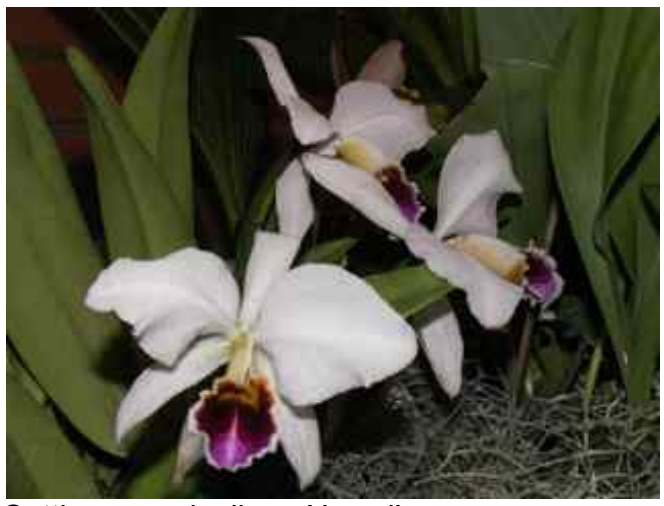
Cattleya percivaliana 'Jewel'

(For more photos, see below.)