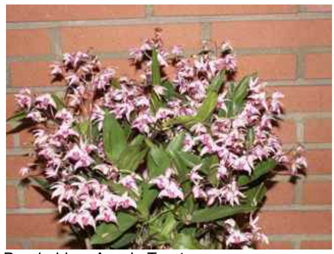
Dendrobium Aussie Treat