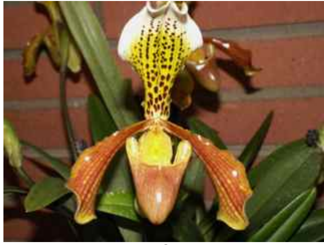
Paphiopedilum Nitens 'Sue'