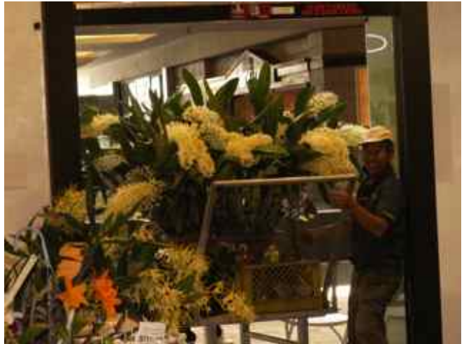
Some plants barely fit through the door