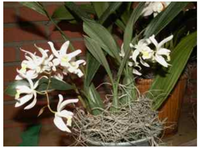
Coelogyne Unchained Melody