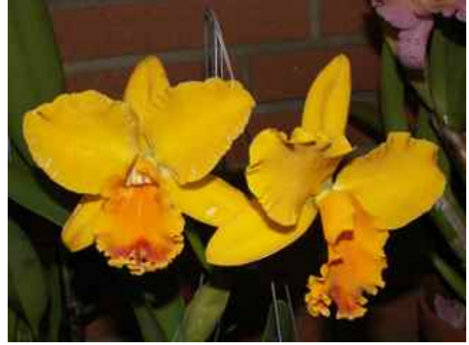
Potinera Solar City 'Showgirl'