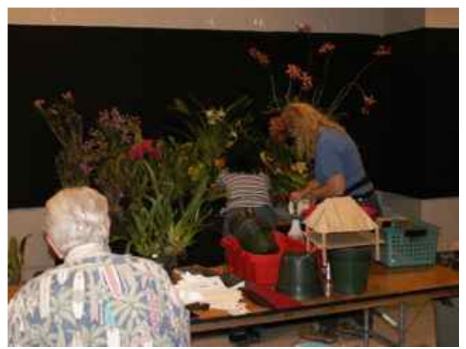
The SCOS Team at work