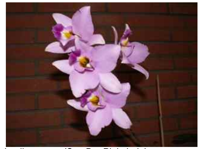
Laelia anceps 'San Bar Pink Jade'