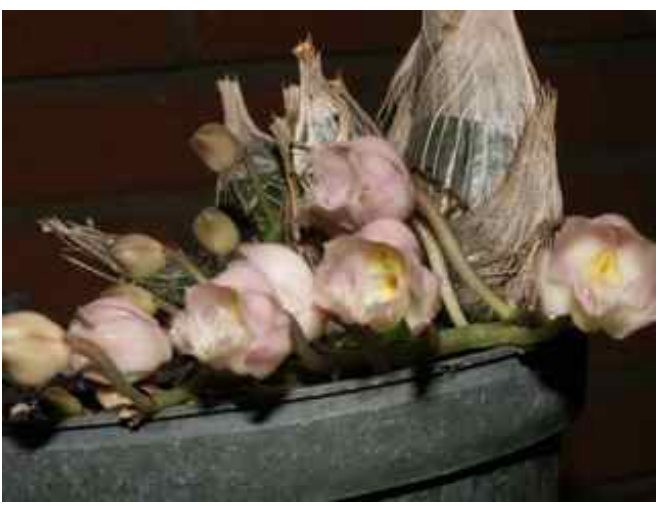
Clowesii Rebecca Northen 'Grapefruit Pink'