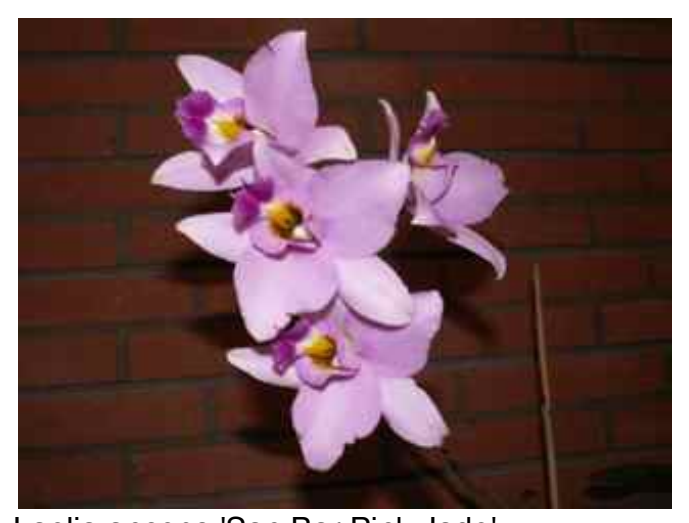
Laelia anceps 'San Bar Pink Jade'