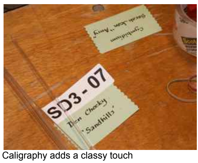
Caligraphy adds a classy touch