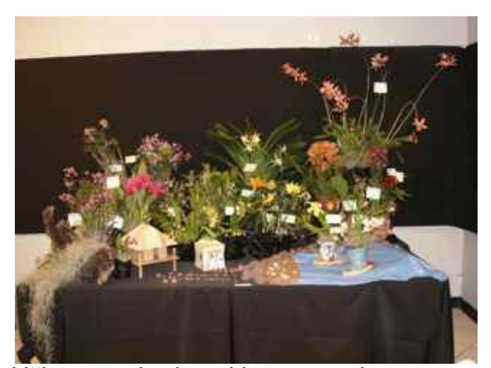
Little grass shacks, a blue sea, and ...