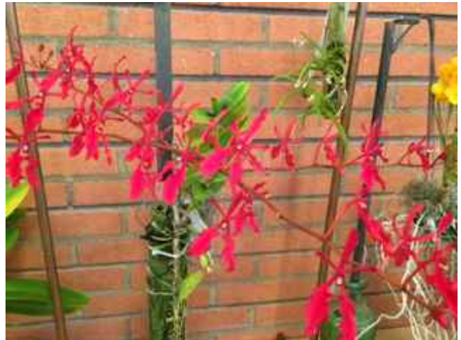
Renanthera Scarlet Yuka