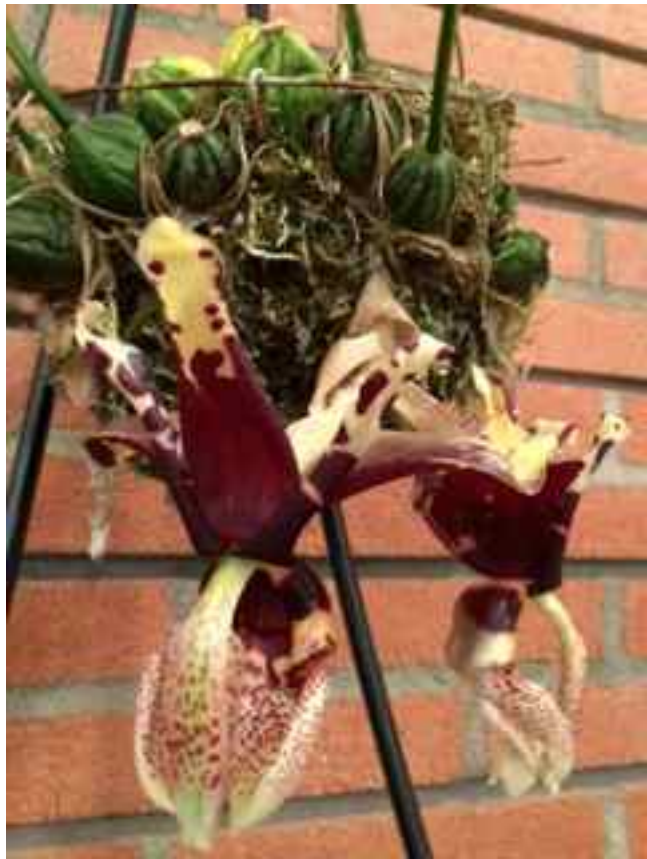
Stanhopea tigrina var. nigroviolacea 'Predator'