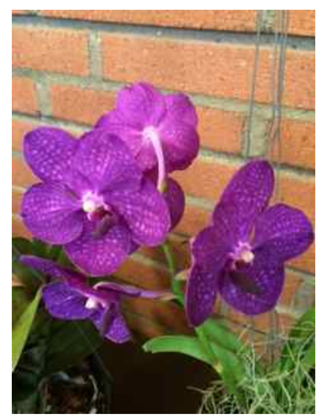
Vanda Pachara Delight