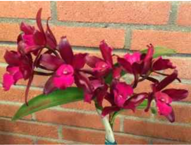
Slc. Chocolate Kiss