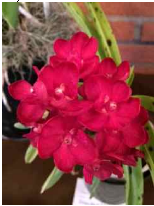
Vasco. Roll On Red 'Pixie'