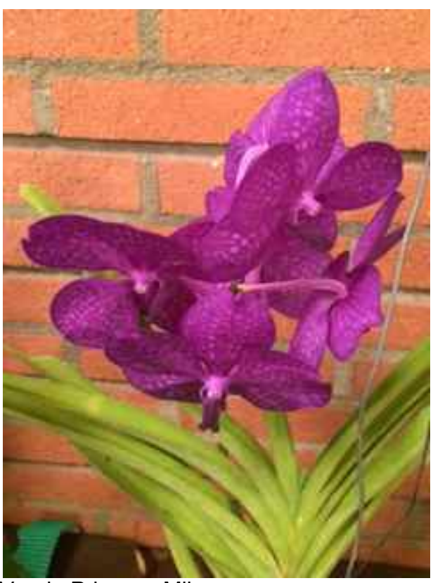
Vanda Princess Mikasa