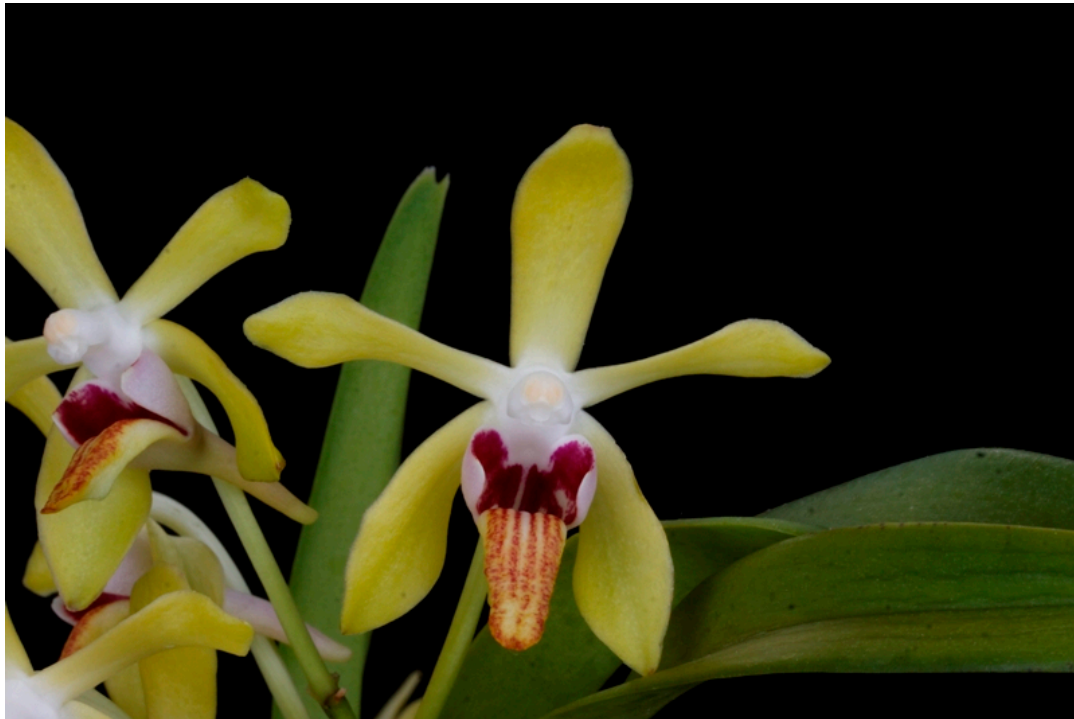
Vanda Newberry Lemon Drops 'Diamond Orchids'