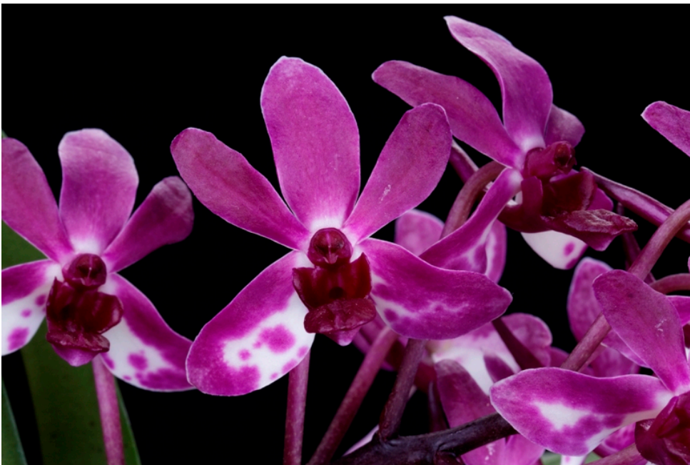
Vandachostylis Pinky 'Purple Rain'