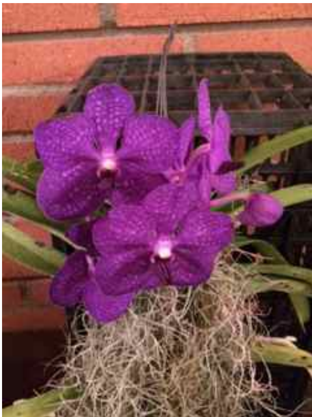
Vanda Pachara Delight