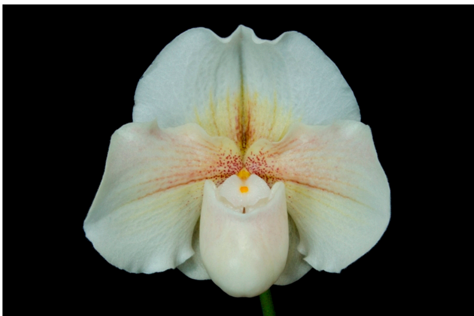
Paphiopedilum Shirokane 'Big White'