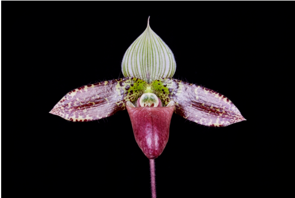
Paphiopedilum sukhakulii 'Dark Delight'