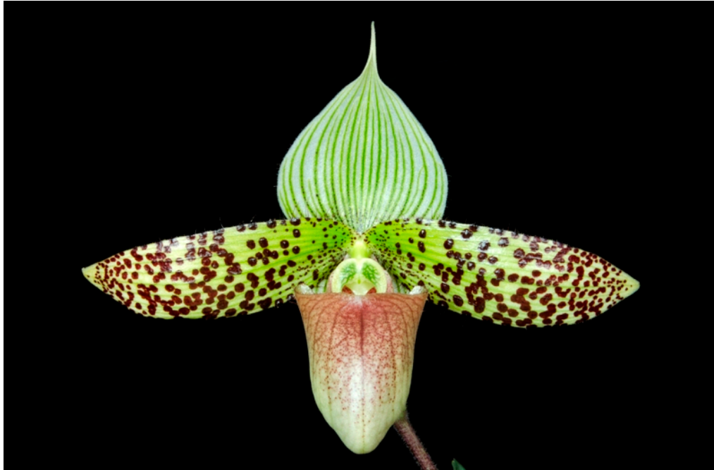
Paphiopedilum sukhakulii 'Pui's Suk'