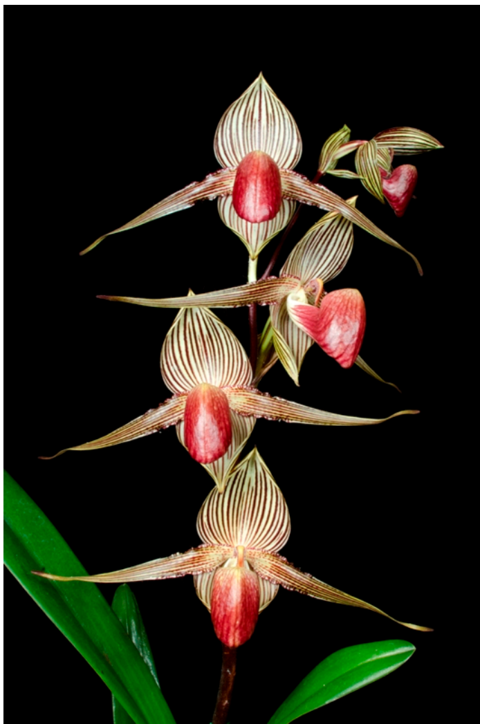
Paphiopedilum rothschildianum 'Steve's Pride'