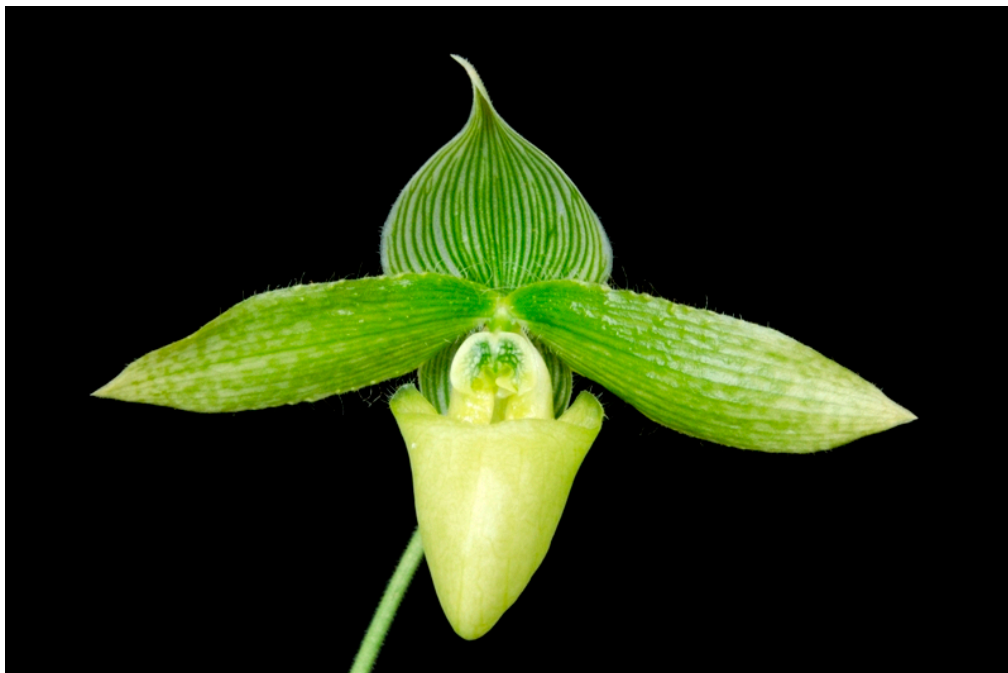
Paphiopedilum sukhakulii var. album 'Green Guy'