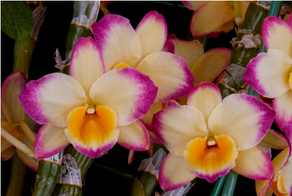
Dendrobium Oriental Smile 'Dzoan Nguyen'