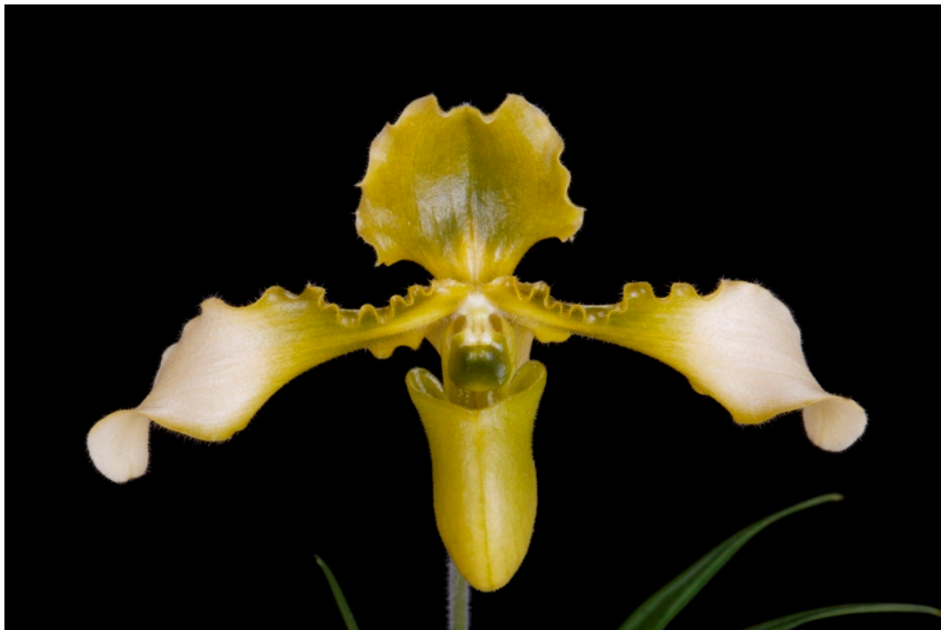
Paphiopedilum esquirolei fma. album 'Green Mustard'