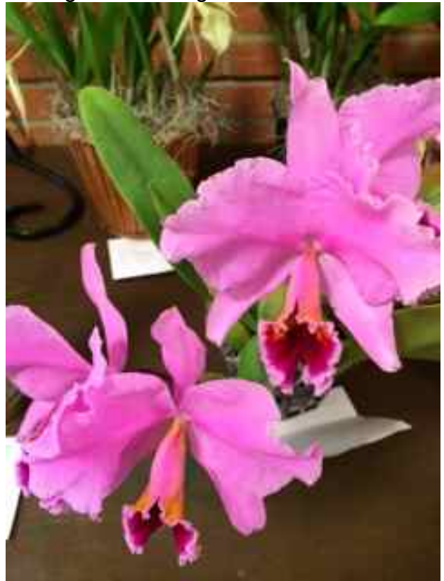
Cattleya percivaliana 'Mendenhall'