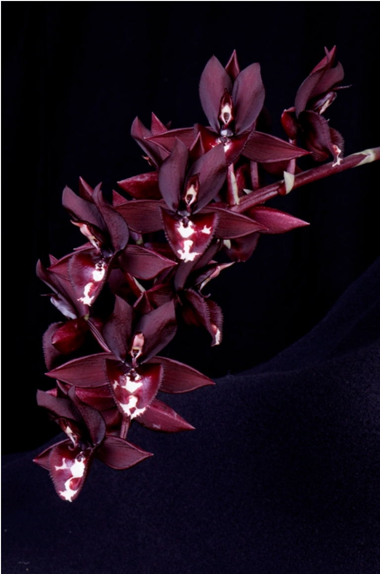
Catasetum Dark Tale 'Holstein Spots'