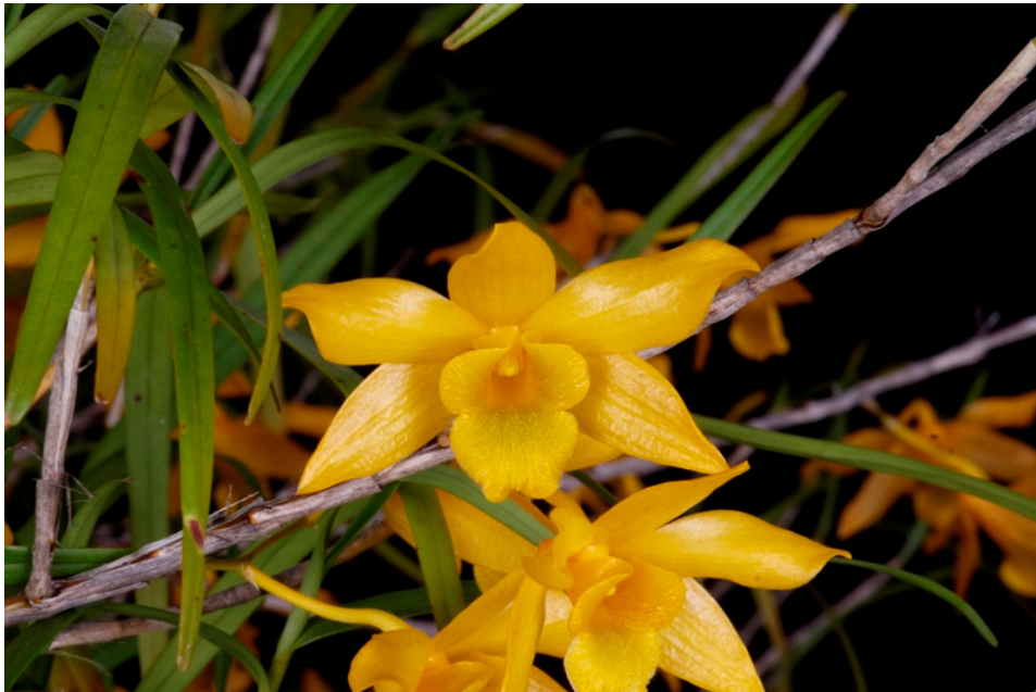
Dendrobium hancockii 'Little Saigon Gold'