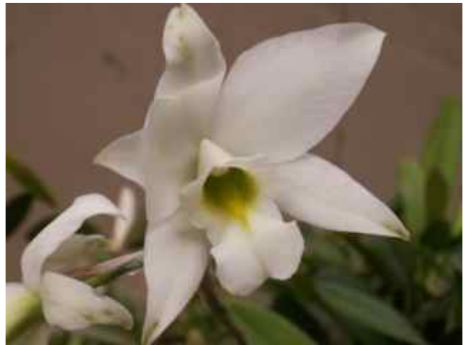
Laelia anceps alba