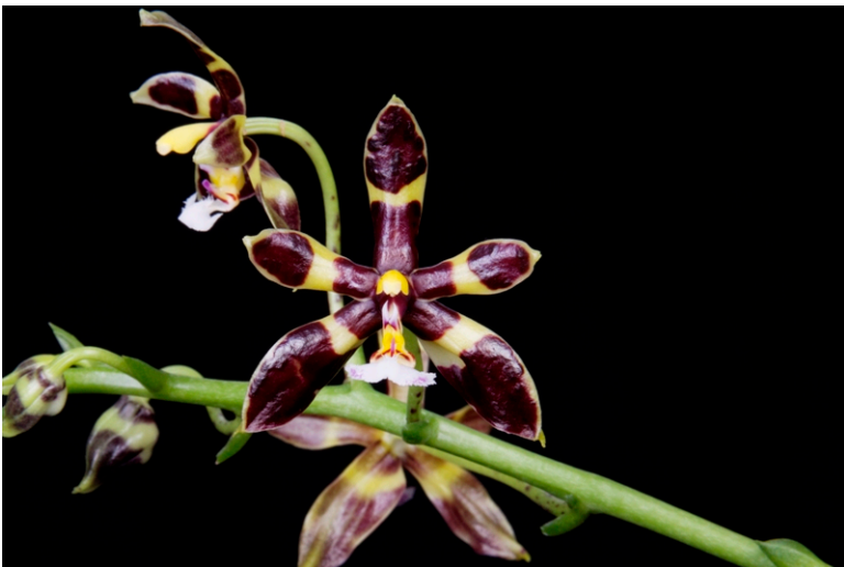
Phalaenopsis mannii fma. black 'Judy Su'