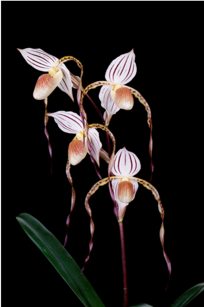
Paphiopedilum Bobby Orr 'SVO Pearl'