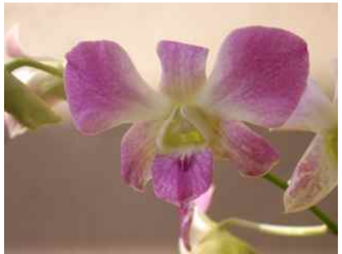
Dendrobium phalaenopsis (bigibbum)