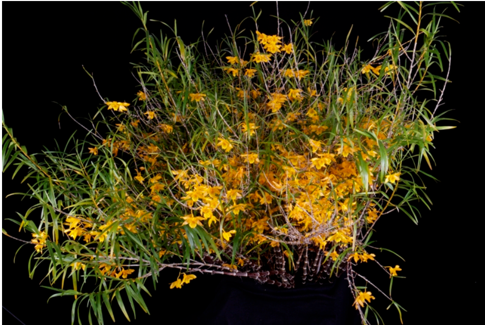
Dendrobium hancockii 'Little Saigon Gold'