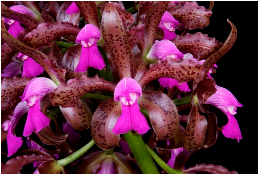
Cattleya tigrina 'Montclair'