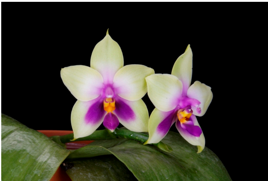
Phalaenopsis bellina fma. coerulea 'Norman'