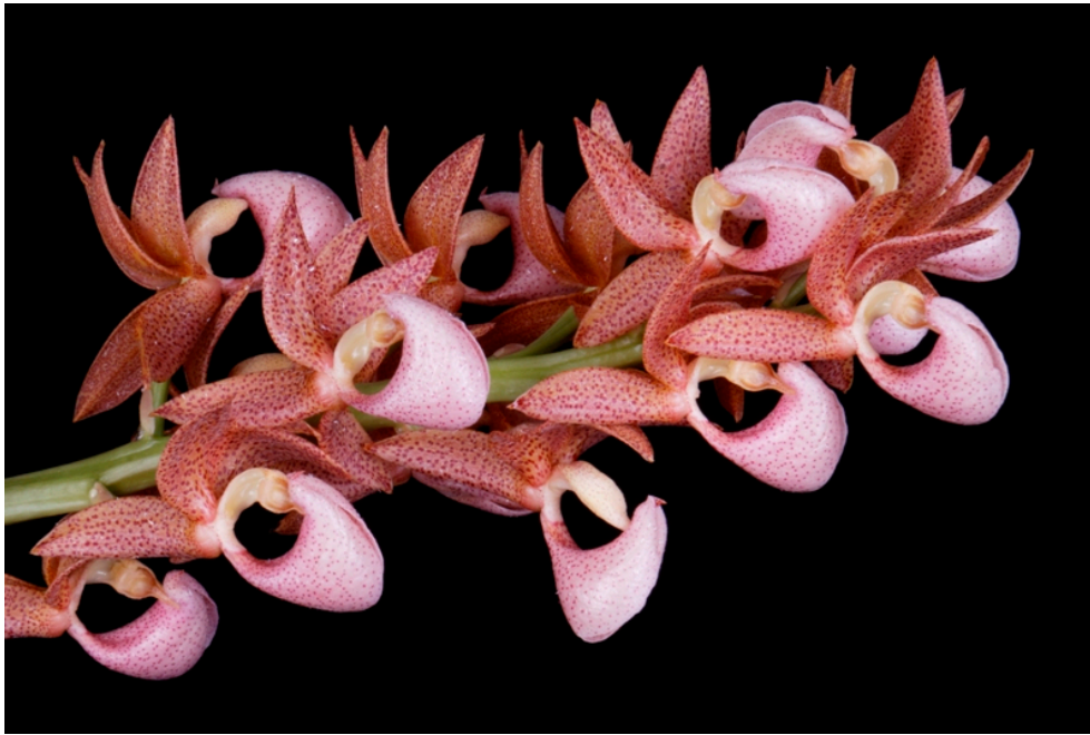
Mormodes buccinator 'Pink Perfection'