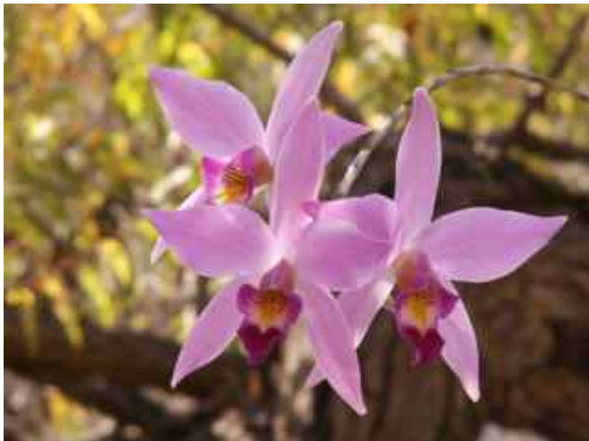
Laelia anceps 'Rebecca Northen'

As is usual this time of year, a majority of orchids in bloom are Laelia anceps varieties and L. anceps crosses, or early blooming Cymbidiums and Dendrobiums . One of the more unusual winter bloomers is Laelia Lucy Ingram , a cross of Laelia purpurata and Laelia perrinii .