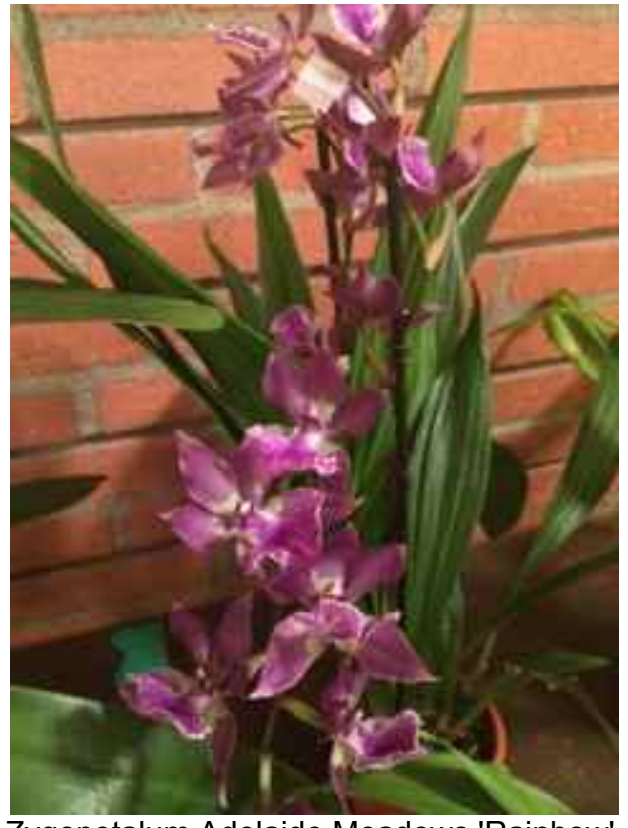
Zygopetalum Adelaide Meadows 'Rainbow'