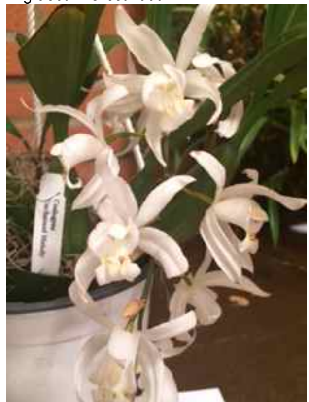
Coelogyne Unchained Melody