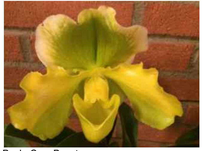
Paph. Coro Beauty

(For more photos, see below.)