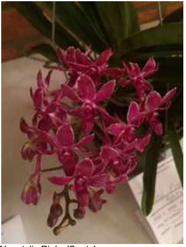
Neostylis Pinky 'Spots'