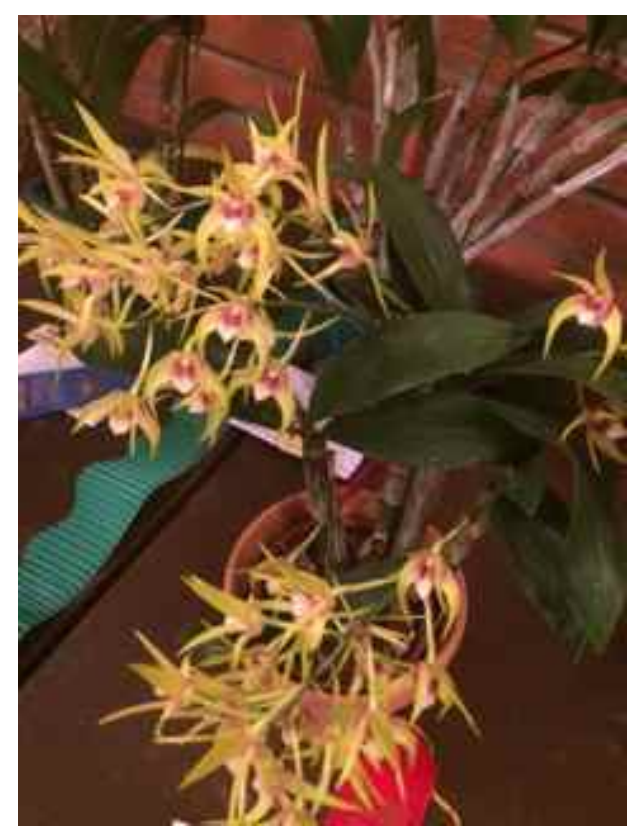
Den. (Regal Gilleston x speciosum v. curvicaule