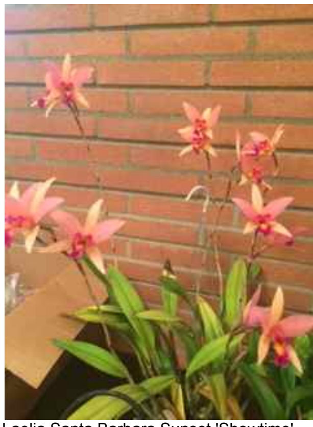
Laelia Santa Barbara Sunset 'Showtime'