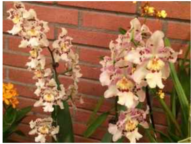
Oncicium Franz Wichmann 'Riverview'