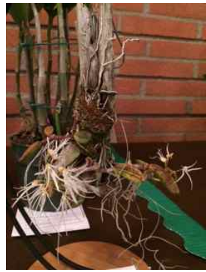
Dendrobium (Dockrilla) linguiforme