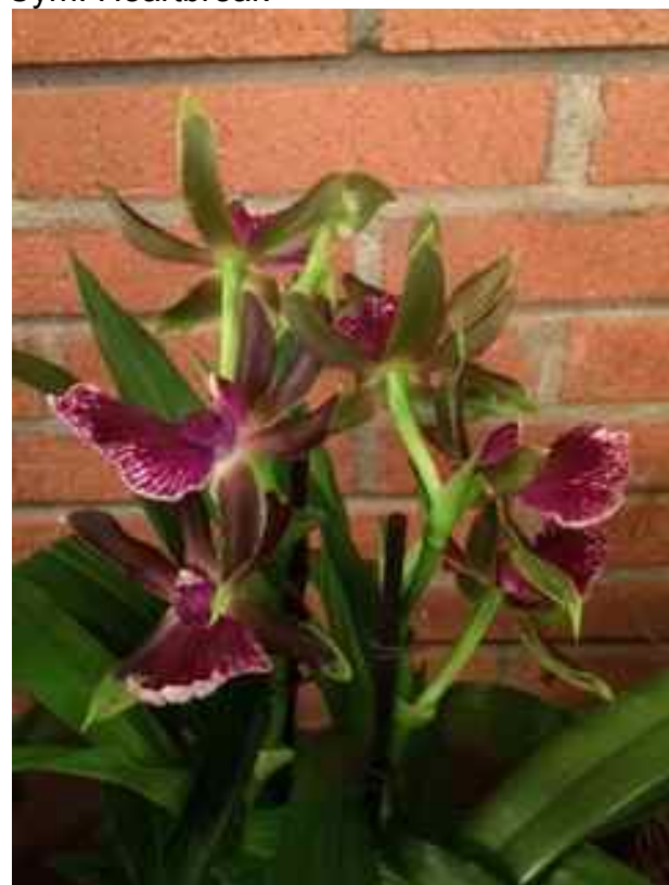
Zygo. Big Red One