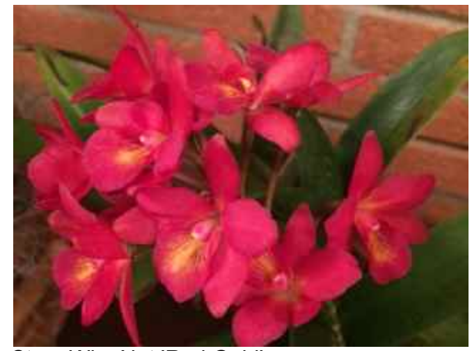
Ctna. Why Not 'Red Gold'