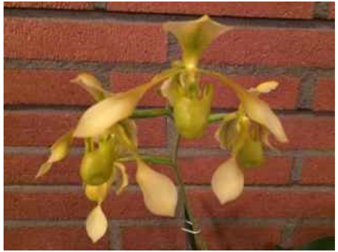
Paph. (lowii v. alba x haynaldianum v. alba)