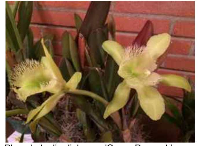
Rhyncholaelia digbyana 'Green Peacock'