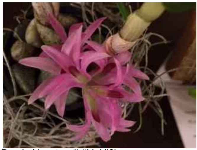
Dendrobium tannii (thinhii?)