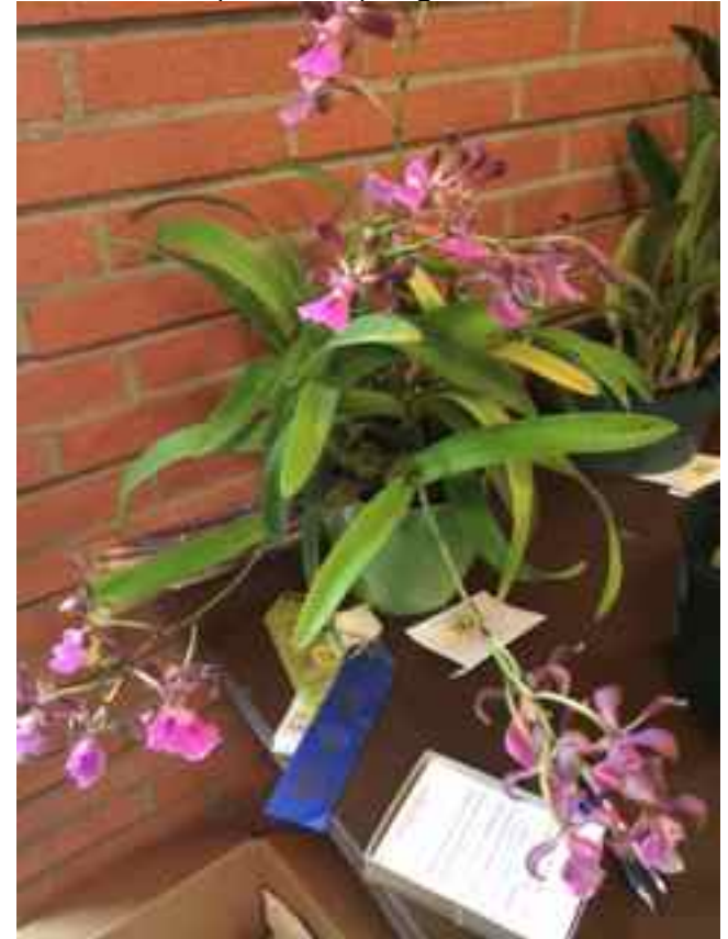
Encyclia Alpine Ridge