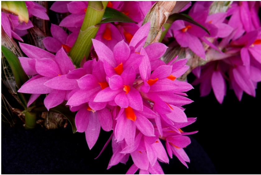
Dendrobium Hibiki 'Pink Elephants on Parade'