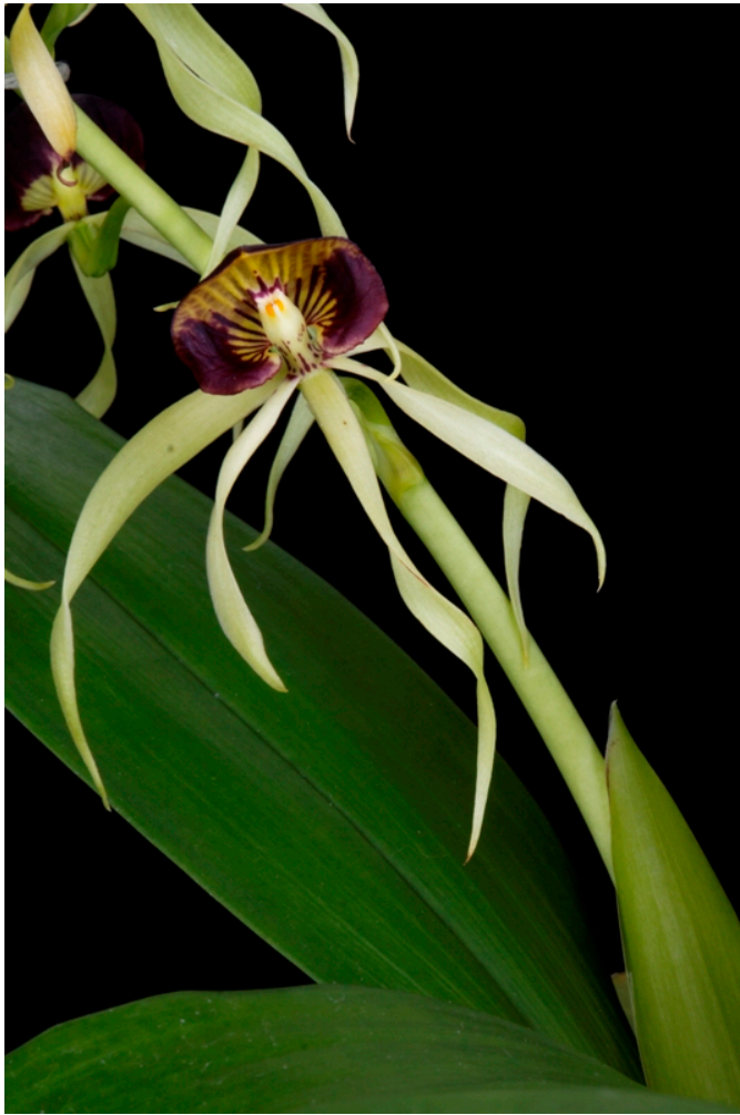
Prosthechea (Encyclia) cochleata 'Green Giant'