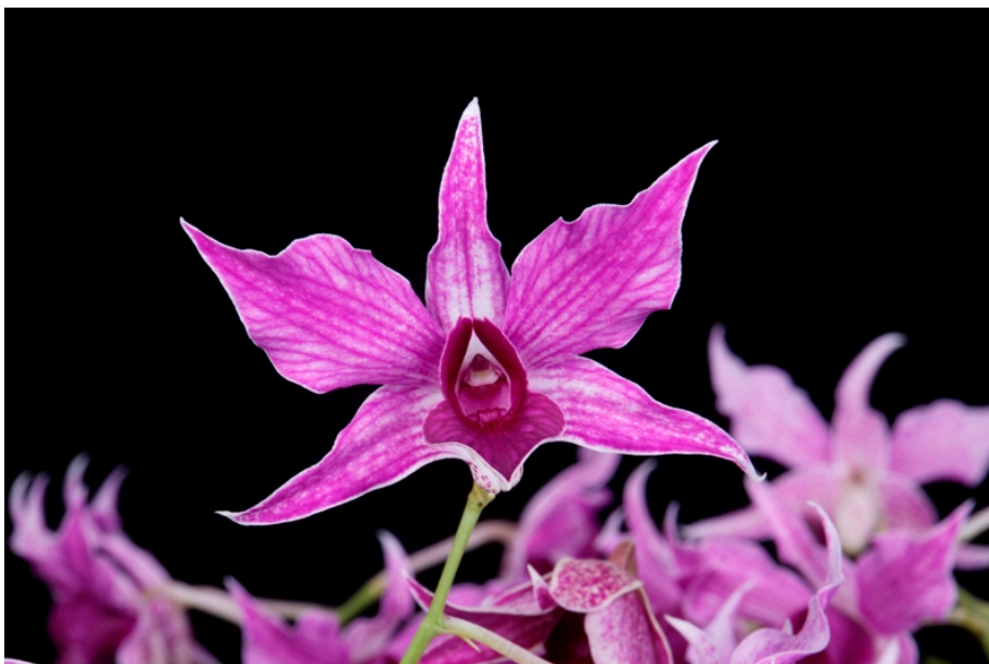
Dendrobium Big Alex 'Elizandro'