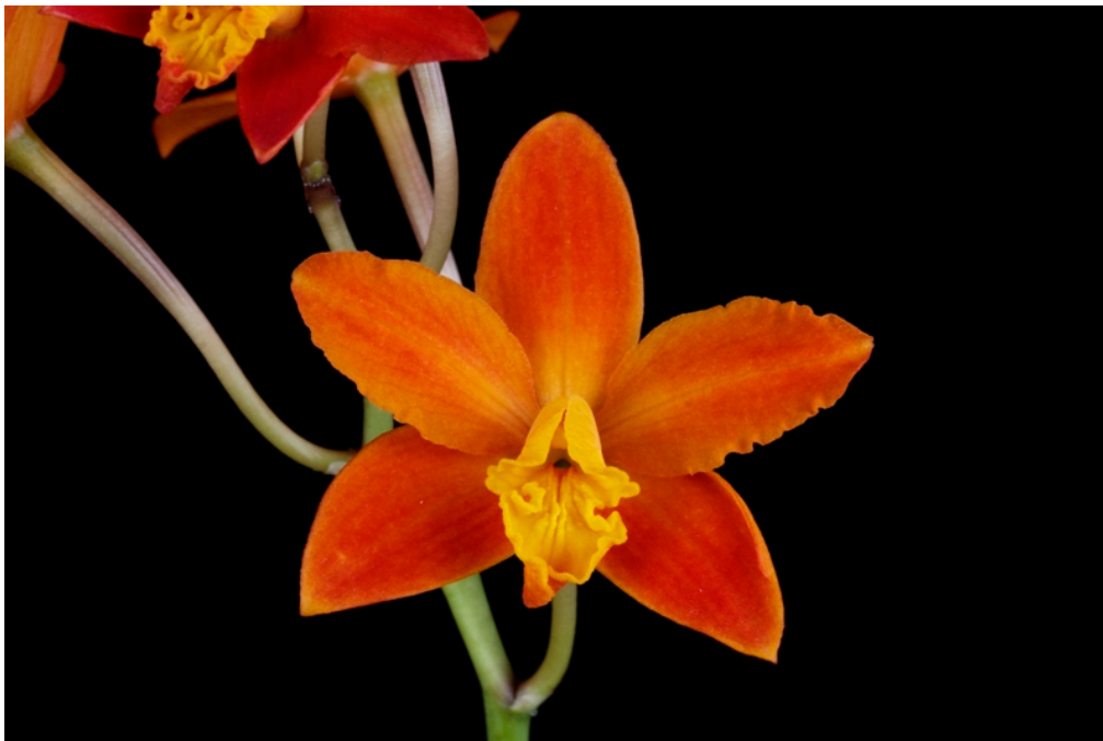
Cattleya (Laelia) Seagull 'Diamond Orchids'