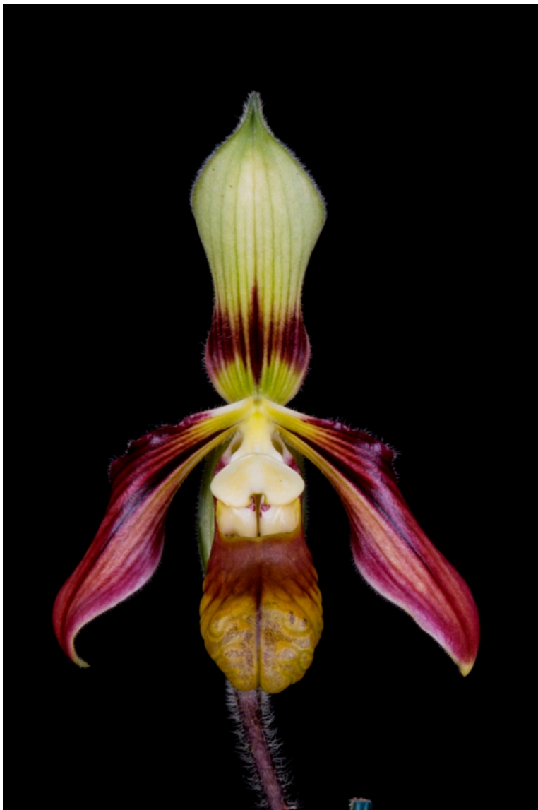
Paphiopedilum sangii 'Lulu'