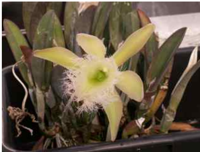
Rhyncholaelia (Brassavola) digbyana file photo