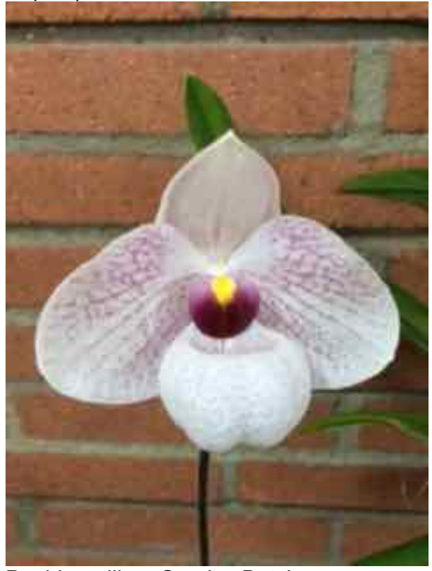
Paphiopedilum Carolyn Butcher