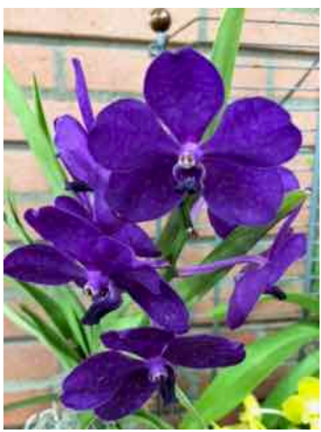
Ascocenda Princess Mikasa