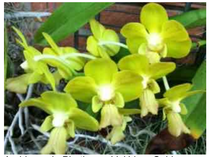
Aeridovanda Photisan x V. Udom Gold