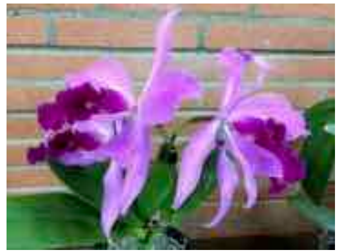
Lc. (C. gaskelliana x L. purpurata)