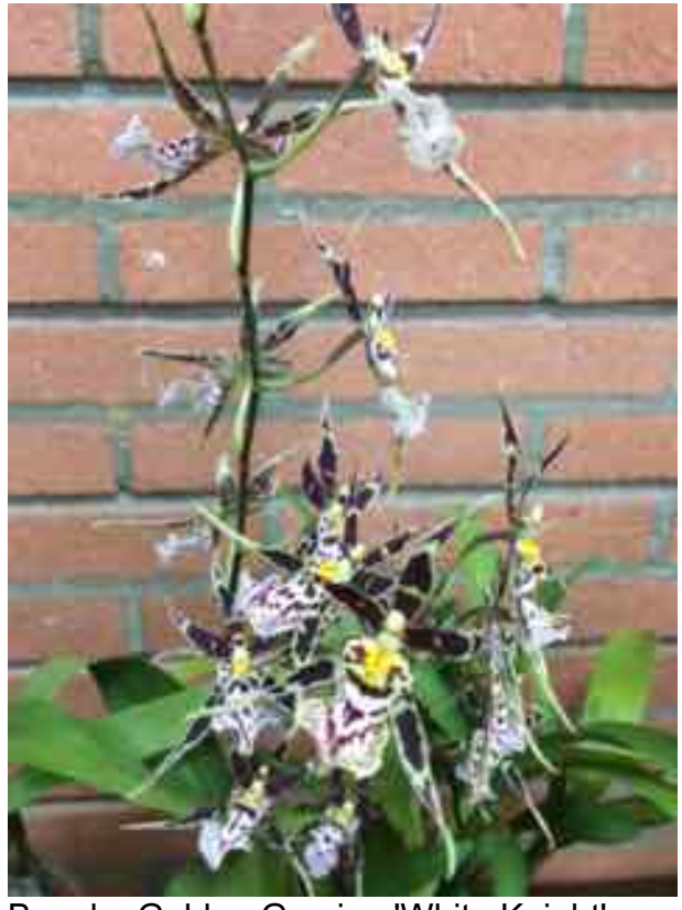
Brscdm Golden Gamine 'White Knight'