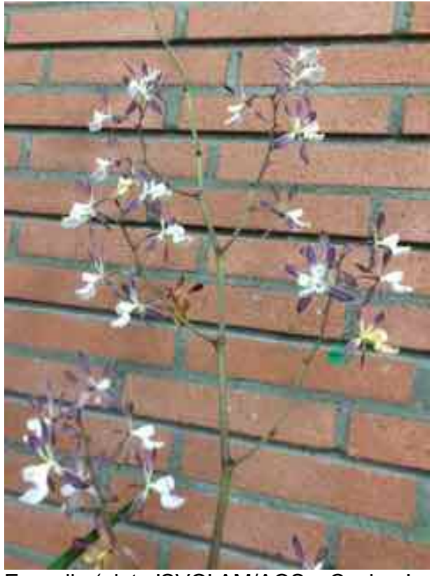
Encyclia (alata 'SVO' AM/AOS x Cashen's Brown Sugar 'Agogo' AM/AOS)