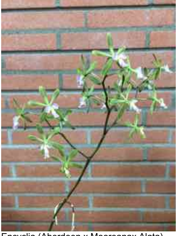
Encyclia (Aberdeen x Mooreanax Alata)