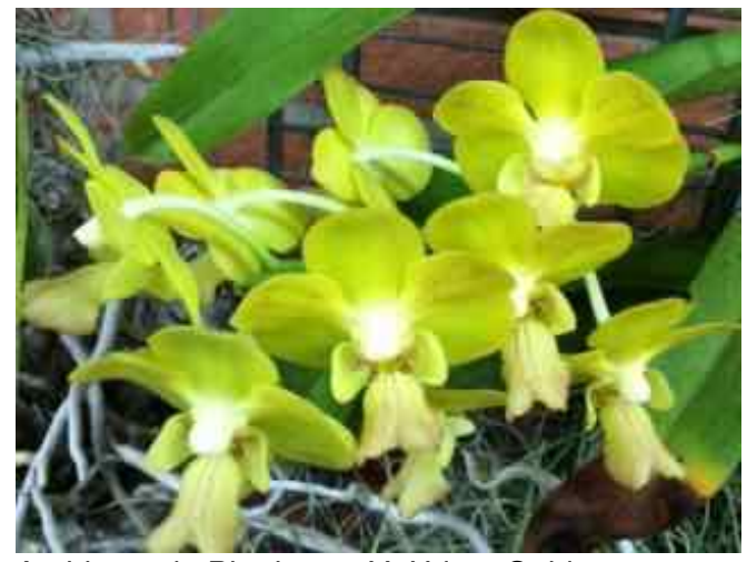
Aeridovanda Photisan x V. Udom Gold