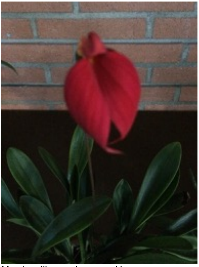
Masdevallia coccinea var. Harryana