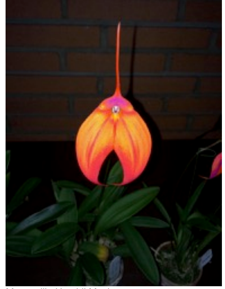
Masevallia Heathii Maxima