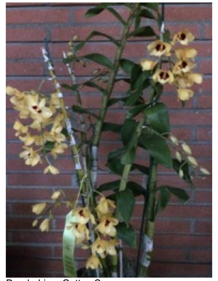
Dendrobium Gatton Sunray