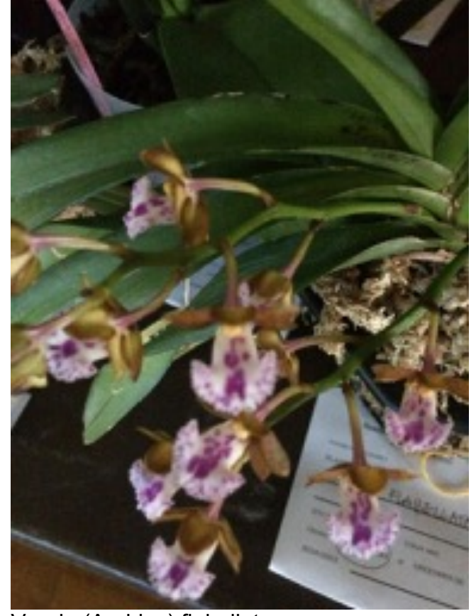
Vanda (Aerides) flabellata