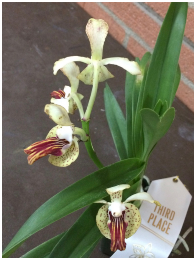
Vanda ( V. suavis x V. longitepala )