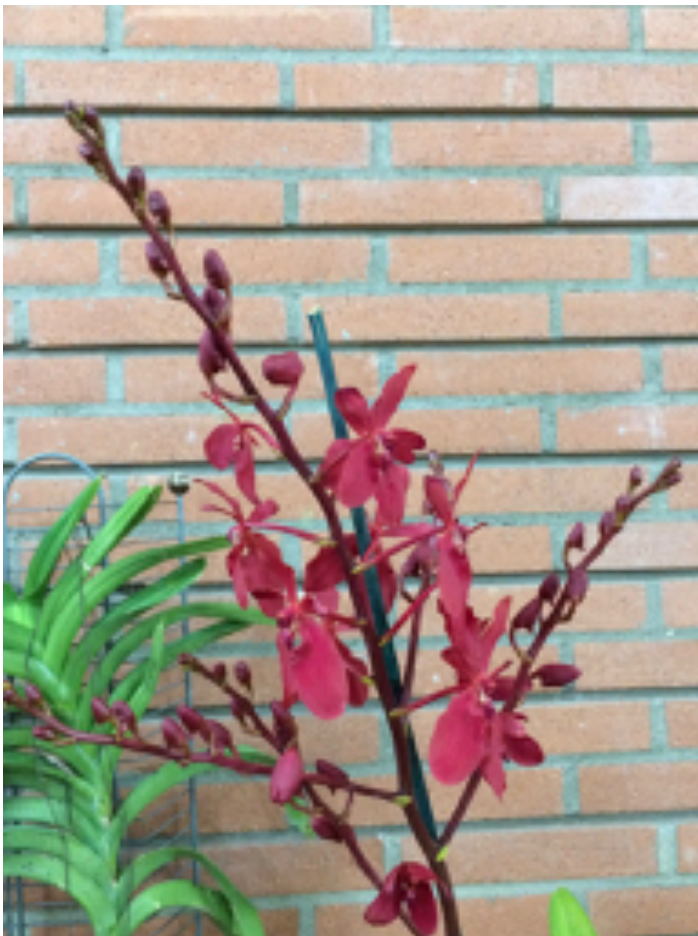
Renanthera Kasen Jumbo