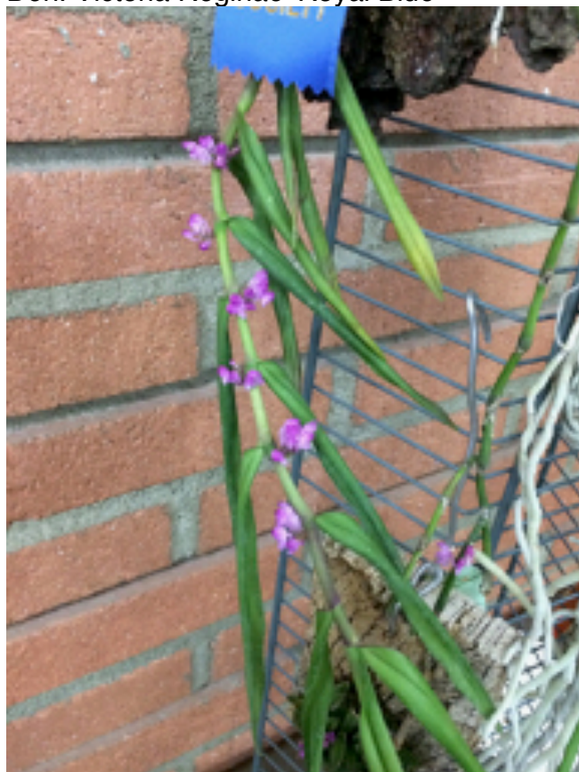
Trichoglottis rosea var breviracema