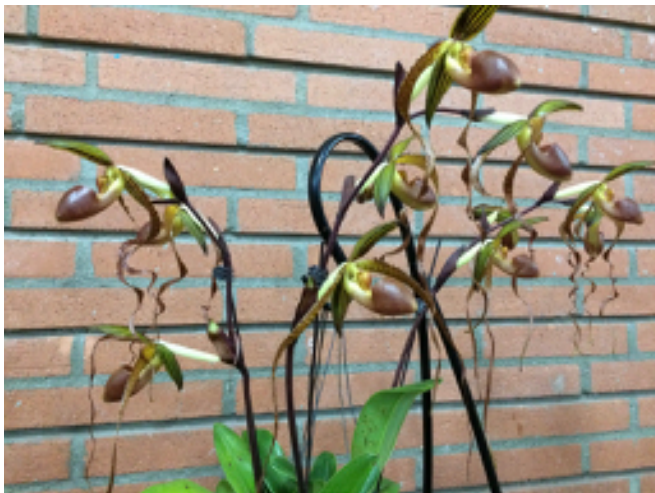
Paphiopedilum Chin Hua Dancer

(For more photos, see our online newsletter at: www.southcoastorchidsociety.com .)