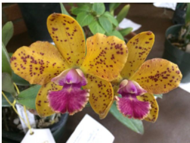
Cattleya Memoria Evelyn Paquette 'Hot Spots' x C. Katherine Clarkson 'SVO' HCC/AOS