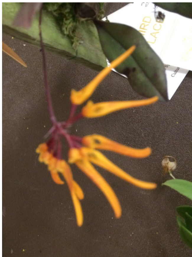
Cirropetalum (Bulbophyllum) thaiorum