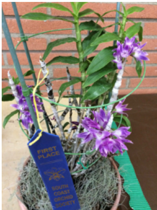
Den. Victoria Reginae 'Royal Blue'