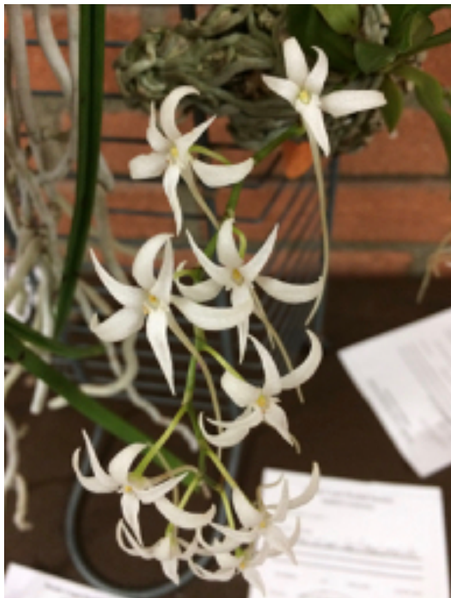
Mystacidium