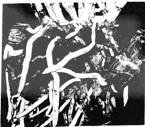
Magnified view showing strong extensive root system typical of plants potted in Silvacon 00.

Packed in 50 lb. 2 cu. ft. polyethylene lined bags. Two sizes, #00 for adult plants and #383 for seedlings. Immediate delivery.