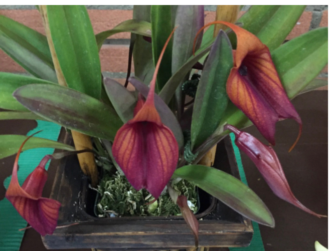
Masd. Prince Charming