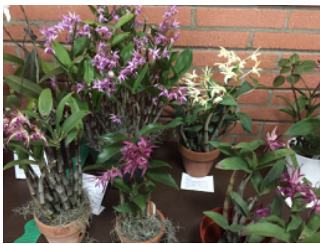
More Hybrid Dendrobiums