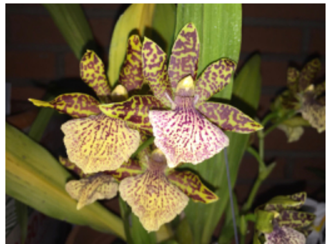
Pbt. Copper Queen