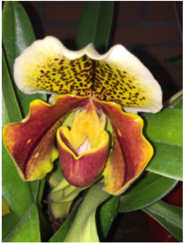
Paph. Trinity Doheny