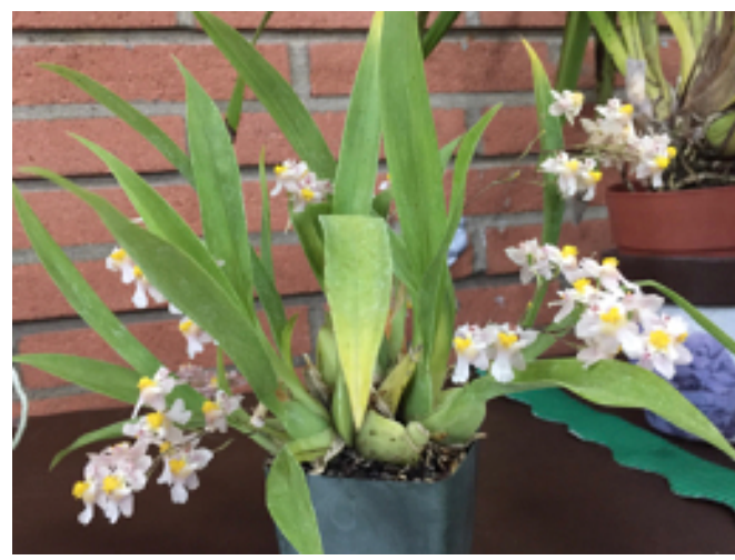
Oncidium Tsiku Marguerite