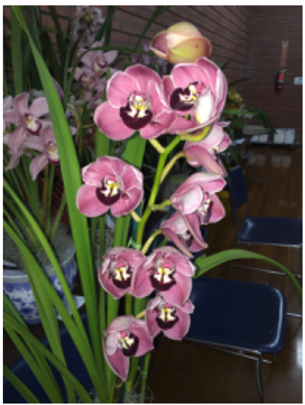
Cymbidium Clarisse Austin