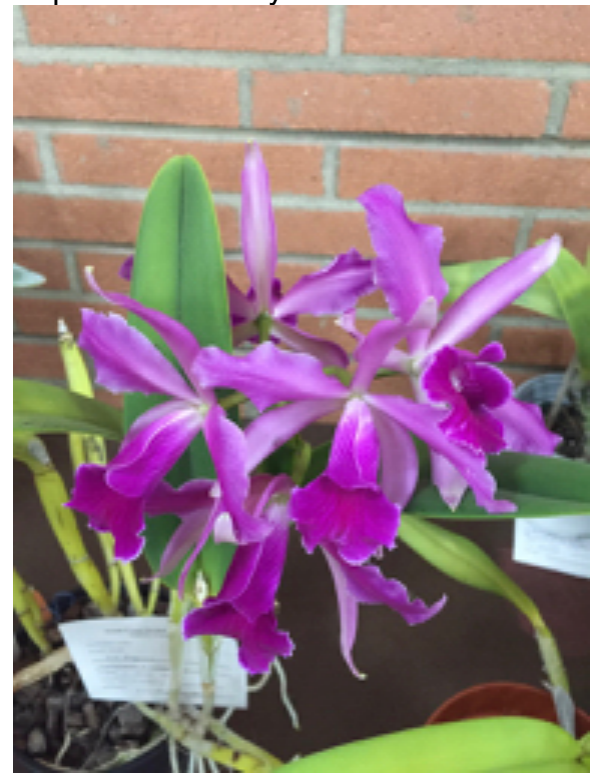
Lc. Elegans (L. purpurata x C. leopoldii)

Thanks to our members for the beautiful flowers.