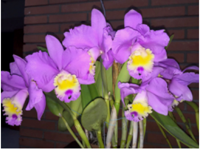
Blc. Mem. Victoria Kam 'Fascination'