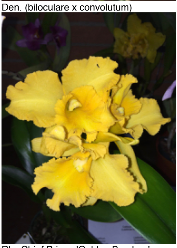
Rlc. Chief Prince 'Golden Bamboo'