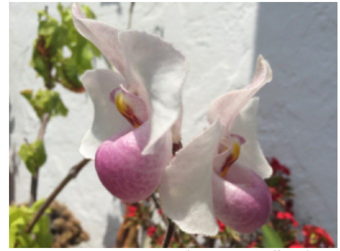
Paphiopedilum delenatii (delenatii 'Tiffany' X delenatii 'Colorama'.) Last month I had one flower. This month I have two! Paph. delenatii is a southern Vietnamese terrestrial or lithophytic species that requires more water from June through December, but even fertilizer throughout the year.