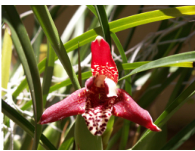
Max. tenuifolia (normal color)