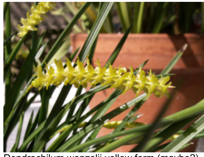
Dendrochilum wenzelii yellow form (maybe?)