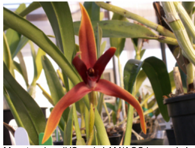
Max. tonsbergii 'Spooky' AM/AOS is spooky!