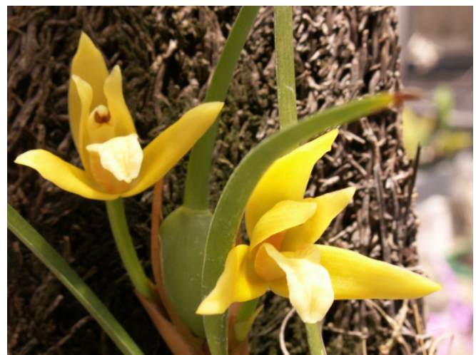
Maxillaria tenuifolia aurea. Though the color is unusual, the flower scent is still ditinctly coconut.