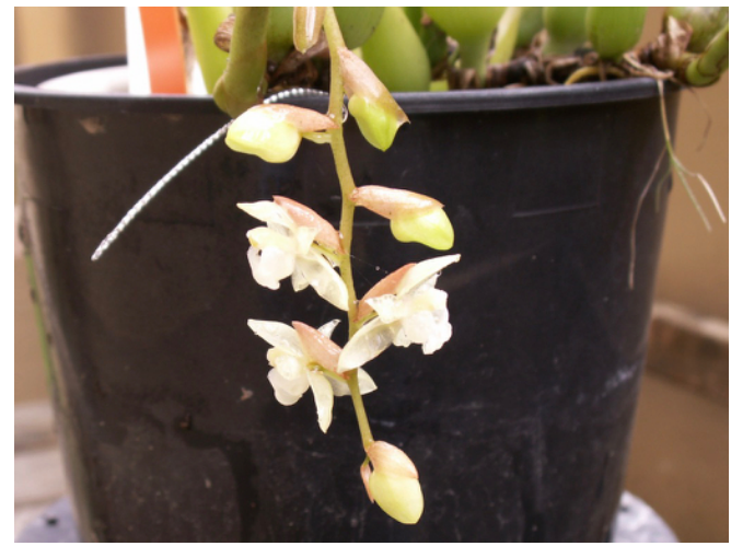
Pholidota chinensis looked like a swamp orchid when I bought it at the species society auction. Who knew, I live in a swamp!