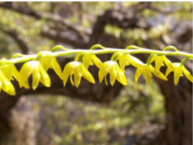
Pleurothallis racemiflora (20 yrs old and tougher than it looks)