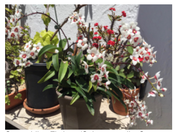
Sarcochilus Fitzhart (S. hartmannii x S. fitzgeraldii) is an intrageneric hybrid that grows well outdoors in So. Cal. Both parent species are found in eastern Australia. Mong.