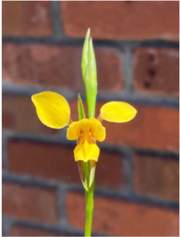
Diuris drummondii is the last of my Australian terrestrial donkey orchids to flower, with bright yellow flowers on tall spikes. It is summer dry/dormant