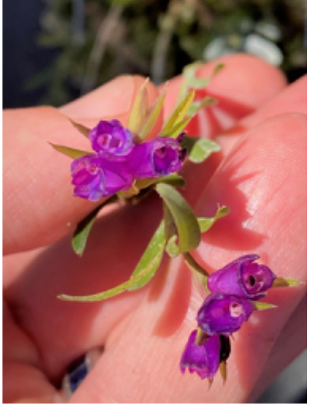
Appendicula malindangenses. I bought Appendicula malindangensis on the claim that it has "true blue" flowers. I collect blue-flowering orchids and so had to have it. My conclusion is that there may be some blue tinge, but that requires some imagination, unlike true blue Thelymitras.