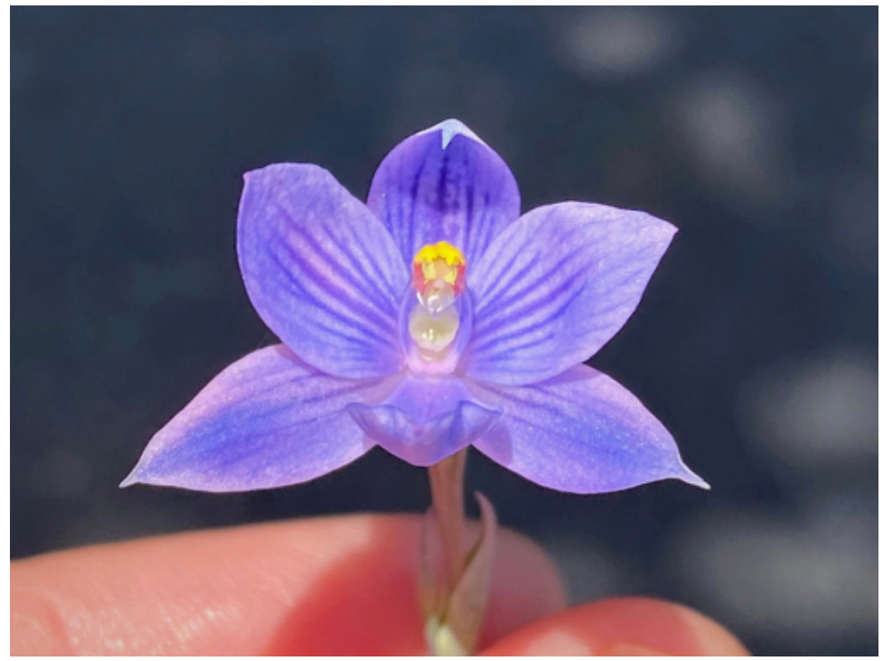
Thelymitra cyanea, the "swamp sun orchid" is the last of my Australian terrestrial Thely's to flower. It has blue/violet striped flowers, and it only likes a brief dry/dormant rest in the summer, unlike most Thely's which are kept bone dry all summer.