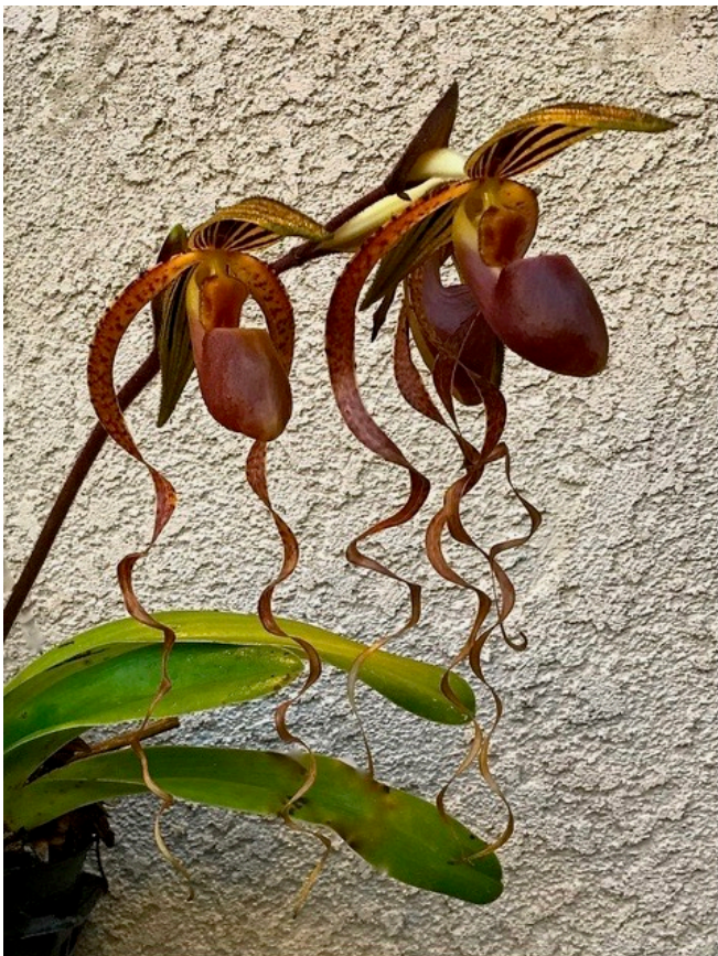
PAPH Chiu Hua Dancer primary hybrid (gigantifolium x sanderianum)