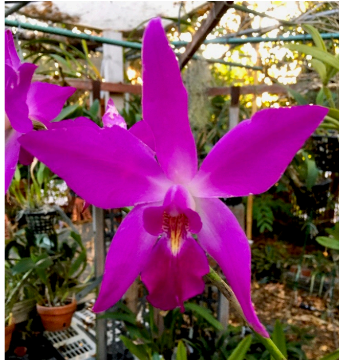
Laelia Nemesis (anceps x superbiens), a hybrid first made in 1902.