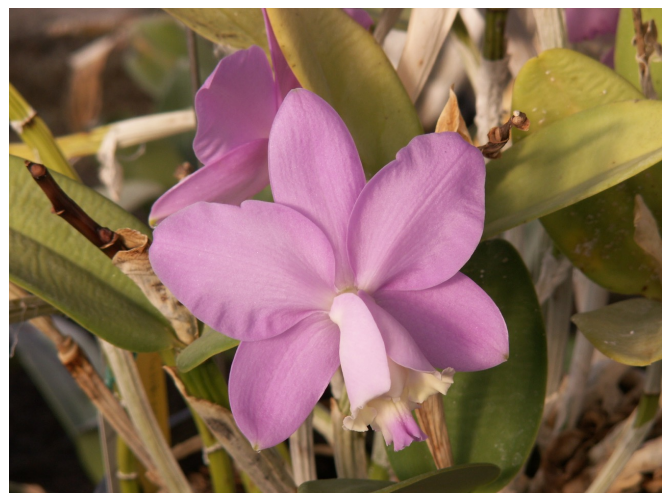
Cattleya loddegessii ('Shorty' x 'Sweetheart'). Russ Nichols