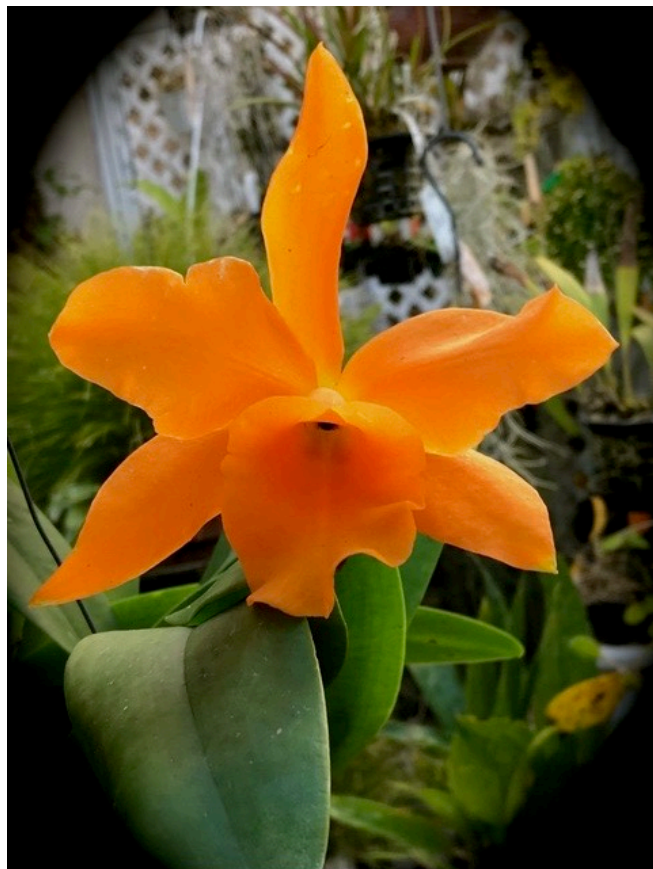
BLC Haw Yan Gold 'Y2K' x Daffodil 'Bee's Wax' Poor shape this time but I love the intense apricot color and firm texture