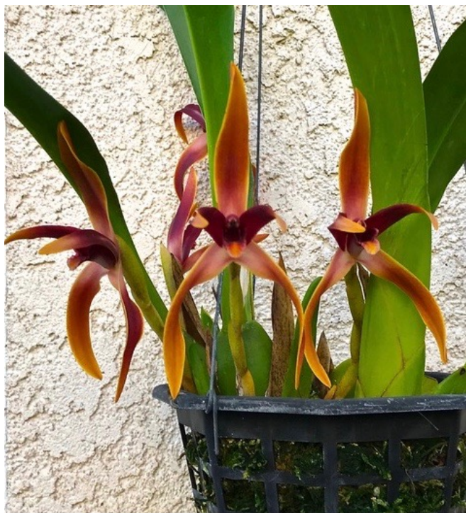
MAXILLARIA species tonsbergii 'Spooky' AM/AOS 5 Flowers and Highly Fragrant! 6 inch moss basket