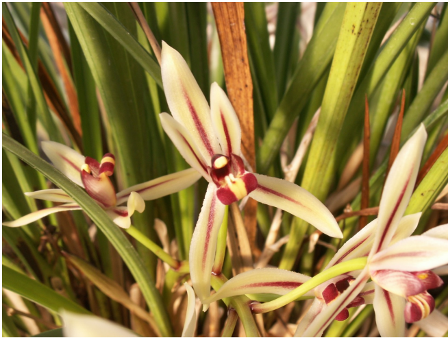
Cymbidium dayanum , from the SCOS Auction 2015. Russ Nichols