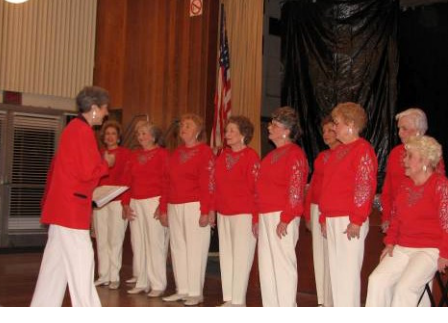
The Choral Bells Entertainment