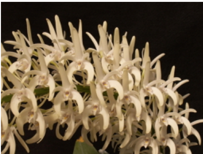
Dendrobium speciosum var. boreale 'Sky Shot' from Northern Queensland, Australia. Russ Nichols