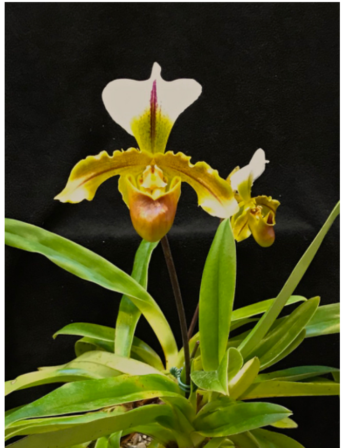
Paphiopedilum Leeanum (insigne x spicerianum) 'My Friend Walter'.