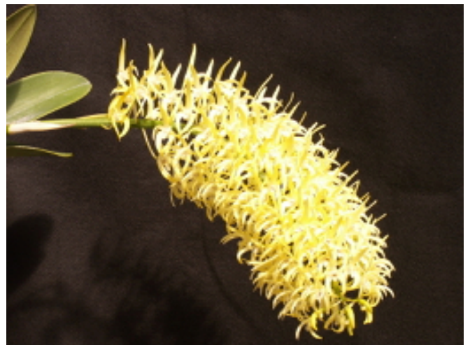
Dendrobium speciosum var. grandiflorum 'Dave's Gold' from Southern Queensland, Australia. Russ Nichols