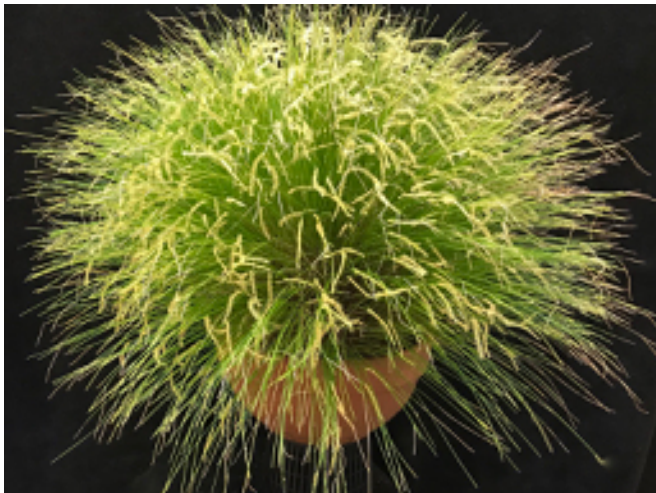
Dendrochillum tenellum from the Phillipines grown in moss in a 10" hanging pot outdoors. Lynn Wiand