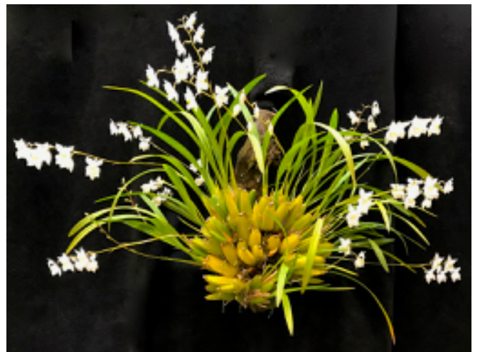
Osmoglossum pulchellum , a species from Mexico grows hanging on a tree branch over Lynn's patio. Lynn Wiand