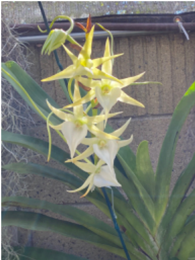
Angraecum Veitchii.