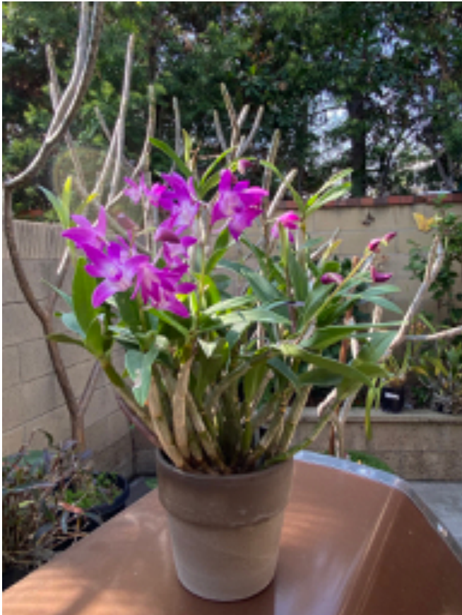
Dendrobium Jonathons Glory 'Dark Joy' is a cross of Australian Dendrobiums producing outstanding dark purple flowers.