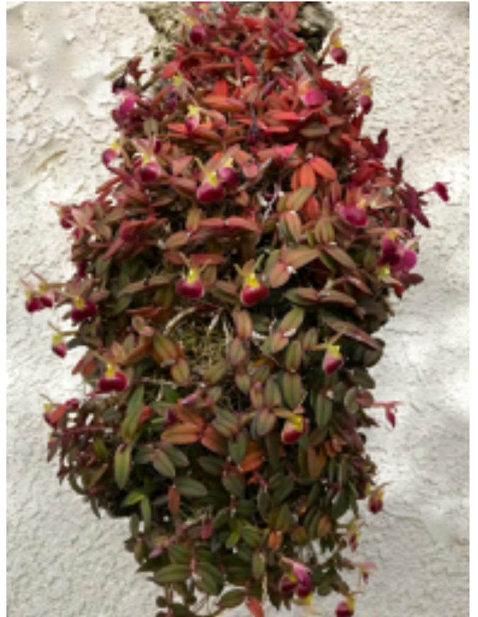
Epidendrum porpax 'Corona del Mar' is a species from Central America.