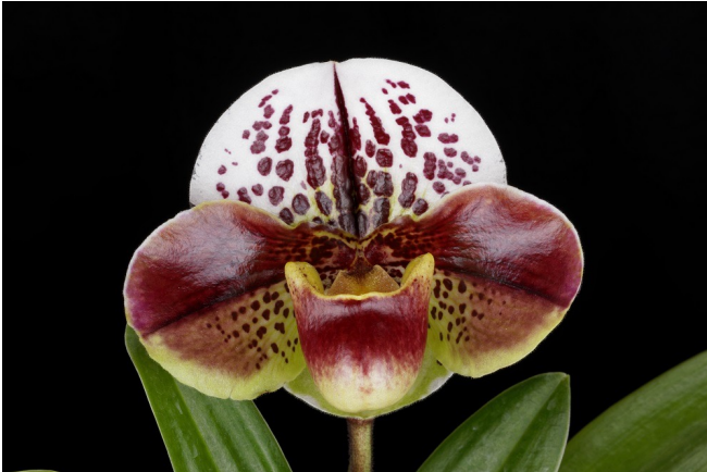
Paph. Punch Drunk 'FANGtastic' HCC/AOS 77 pts. Exhibited by Norman's Orchids