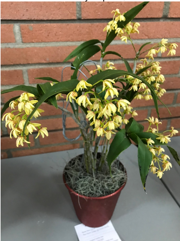
Dendrobium gracilicaule Exhibited by Espie Quinn