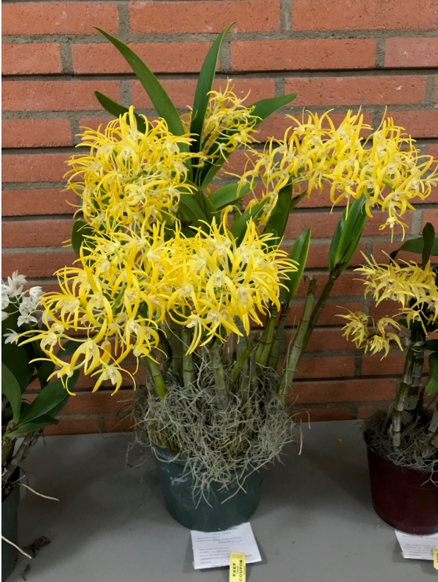
Den. speciosum 'Buttercup' Exhibited by Espie Quinn