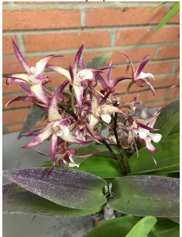
Den. (Royal Vista 'SVO#1' x Den. speciosum 'Windermere') Exhibited by Una Yeh