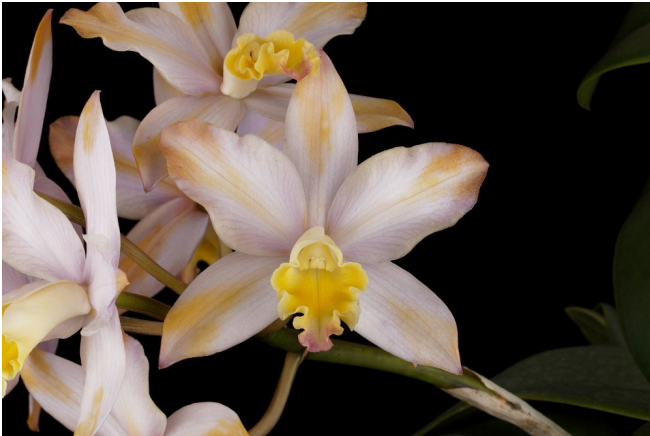
Cattlianthe Magic Bell 'Diamond Orchids' AM/AOS 85 pts. (C. lodigesii x Ctt. Trick or Treat) Exhibited by Diamond Orchids