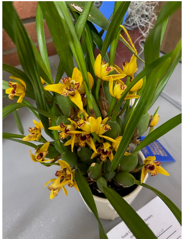
Maxillaria Ben Berliner 'Yellow Cape'