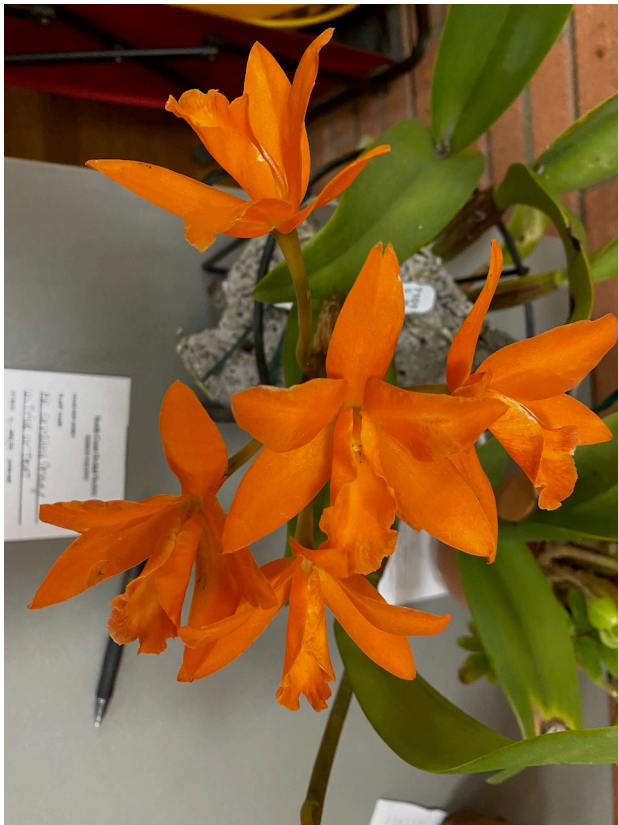
Blc. Carolina Orange x Lc Trick or Treat