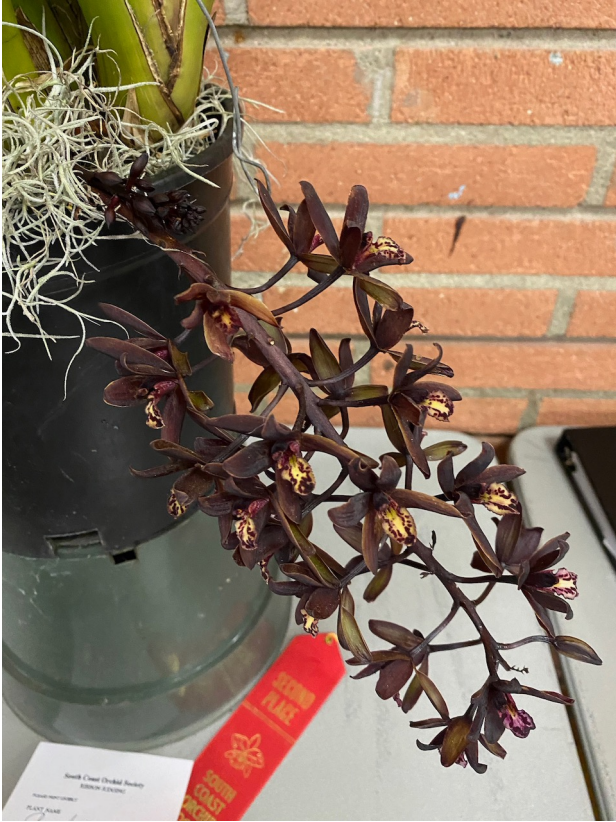
Cym. Australian Midnight