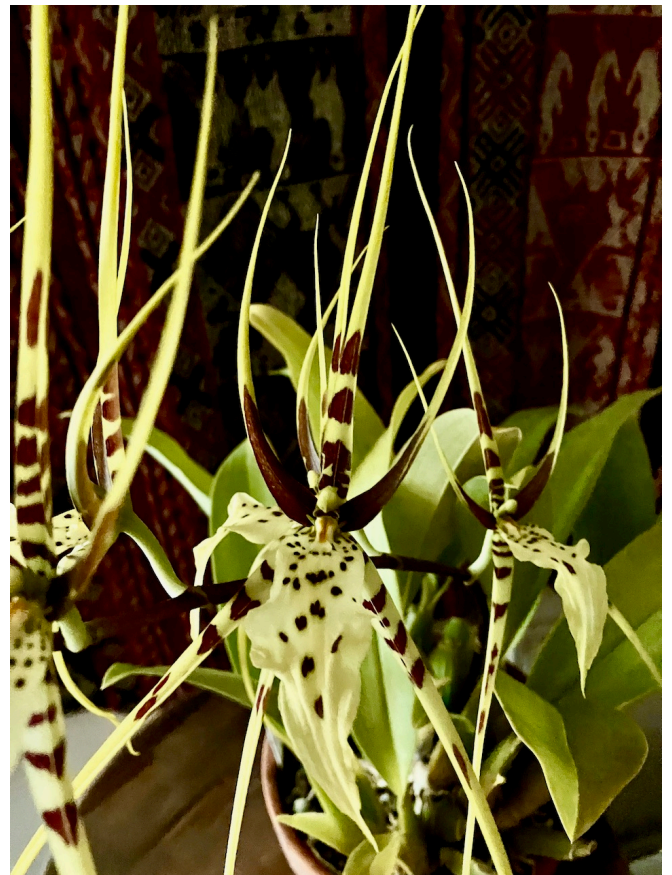
Brassia Spider's Gold 'Prolific'