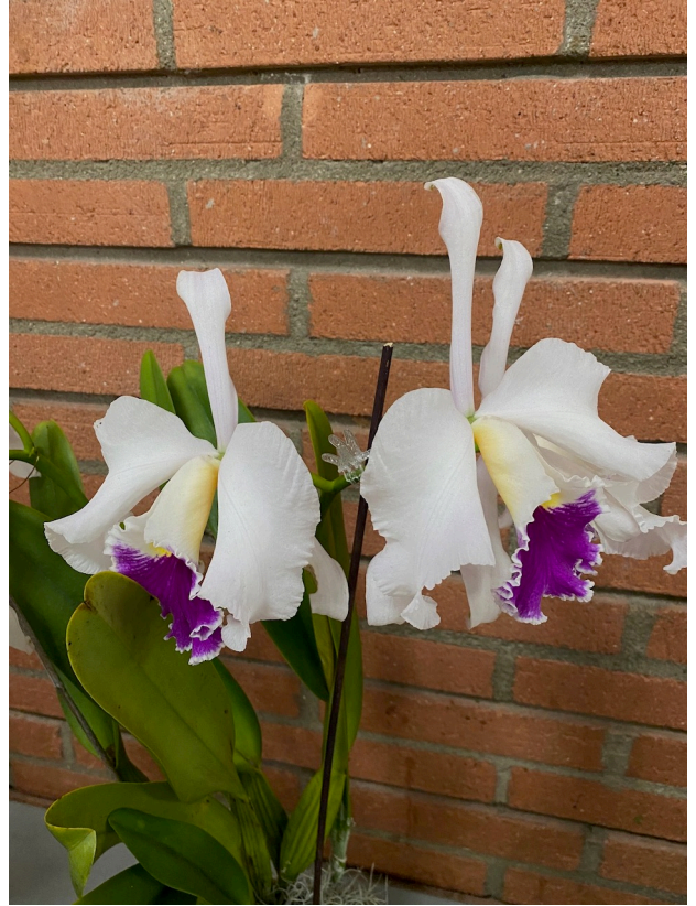
Lc. Stonehouse 'Leonard Webster'