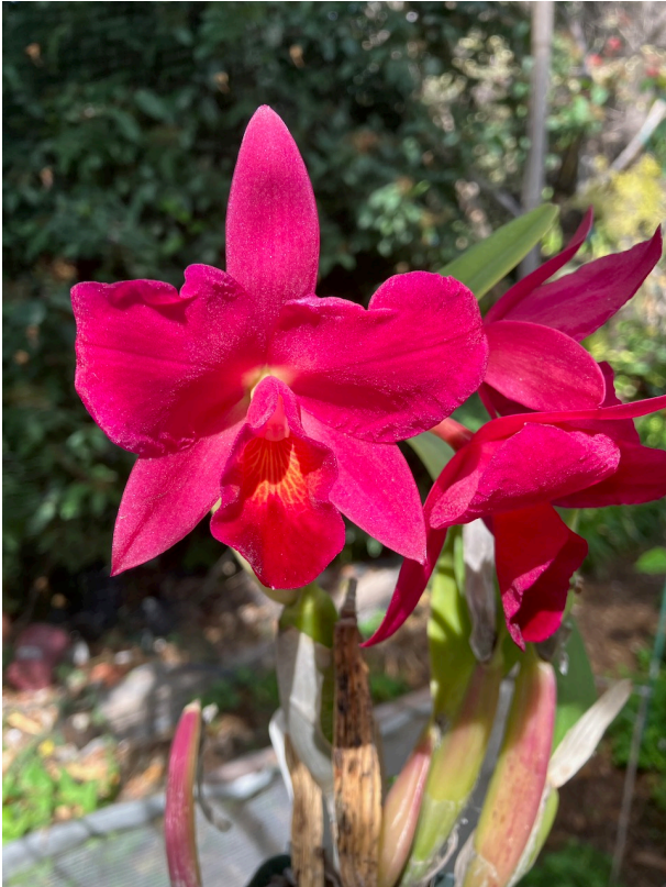
Ctt. (Ctt Red Marsh x C Richard Stone)