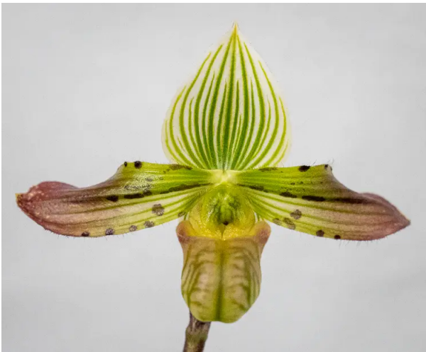
Paph. venustum