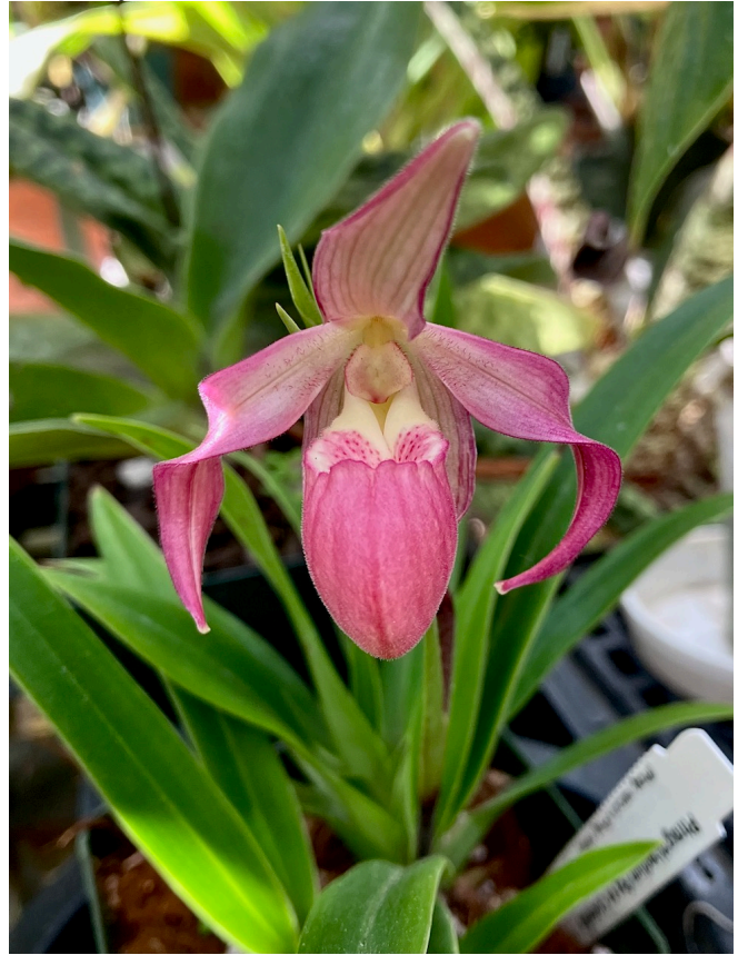
Phragmipedium Paz en Colombia A small plant, very beautiful, with hopes that it may thrive.