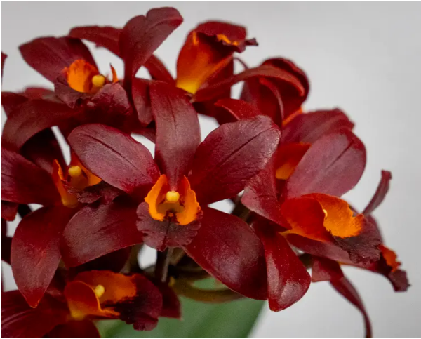
Pot. Kool Treat 'Super Red' by Espie Quinn