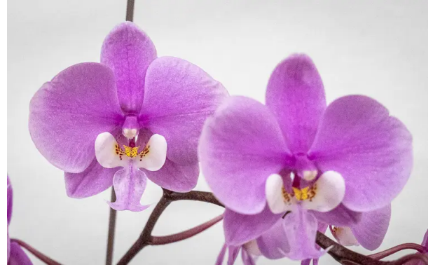
Phal. schilleriana