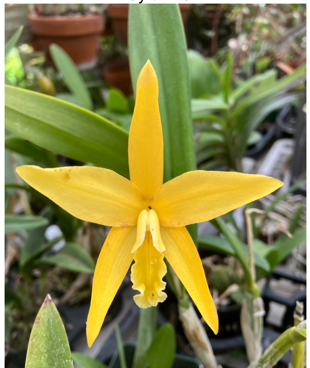
Lc. Canariensis 'California's Gold'