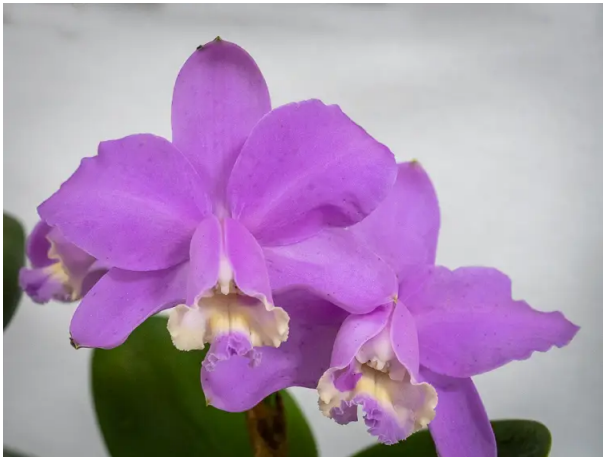
Cattleya loddigesii