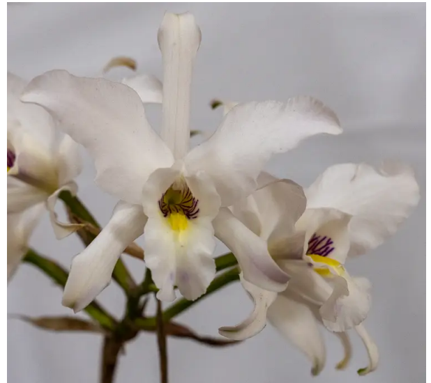
L. anceps var Oaxaquena