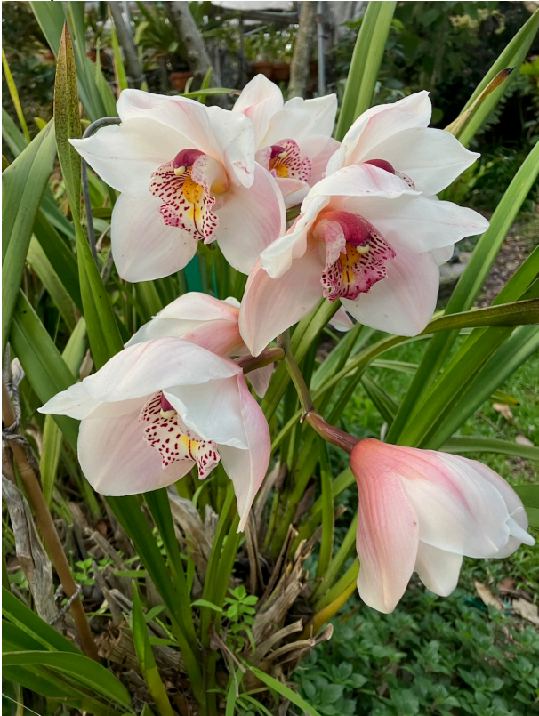
Cymbidium Woody Wilson