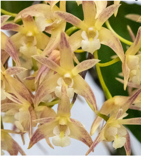
Den. Royal Vista x speciosum by Eva Von Huff