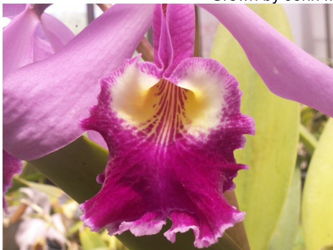
Cattleya warscewiczii var. sanderiana lip