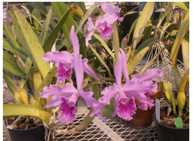
Unknown grown by Russ Nichols