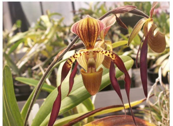
Paphiopedilum Berenice ( lowii x phillipinense ) grown by Russ Nichols