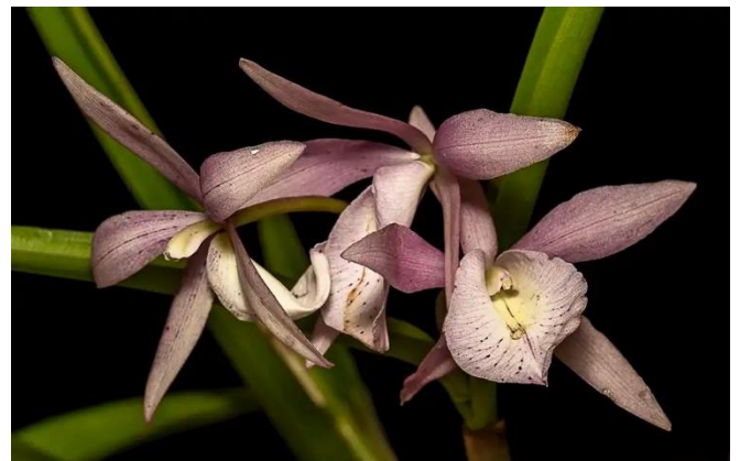
Blc. Little Mermaids x B. perrinii grown by Una Yeh