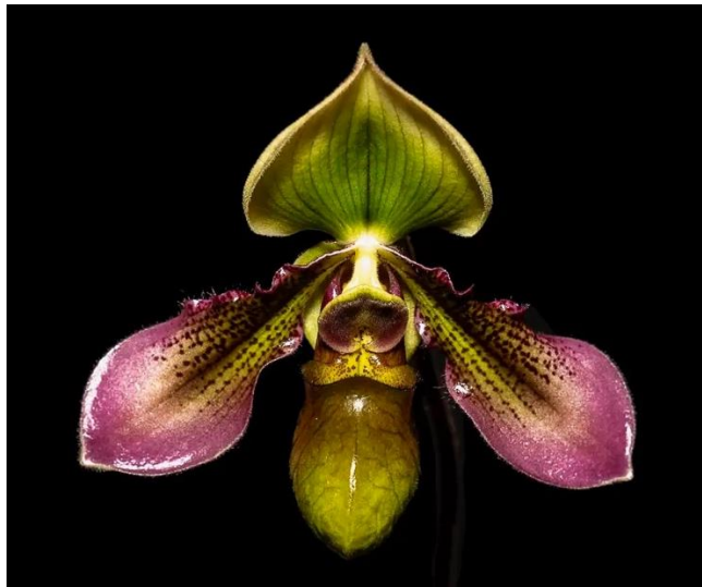
Paphiopedilum hookerae grown by Don Goss