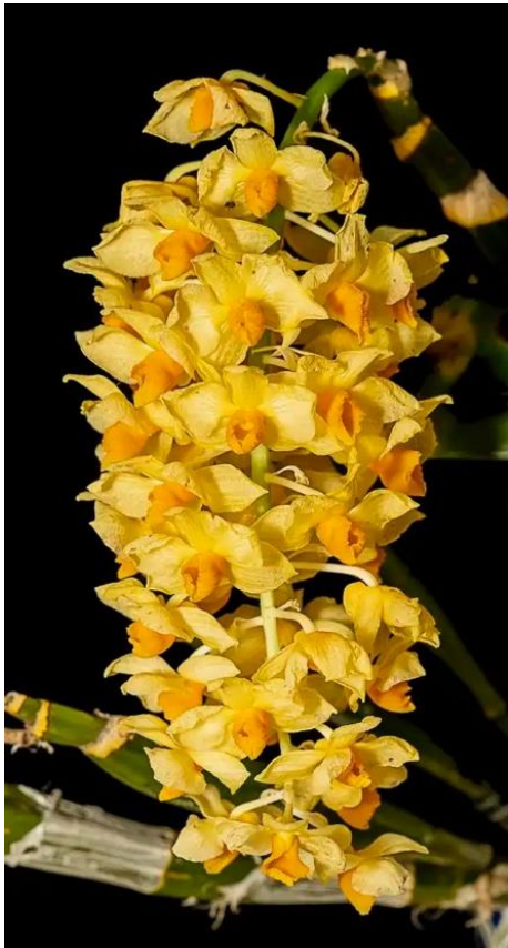
Dendrobium densifolium grown by Eva Von Huff