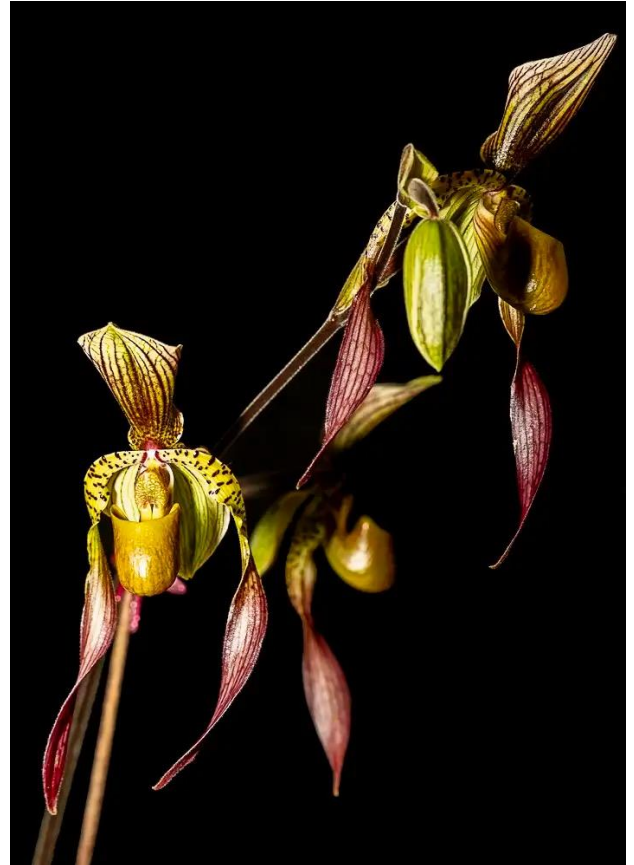
Paphiopedilum Robiniacum grown by Espie Quinn