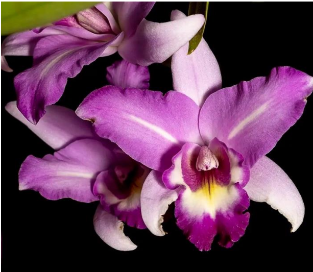
Lc. Miss Wonderful 'Imperialis' grown by Una Yeh