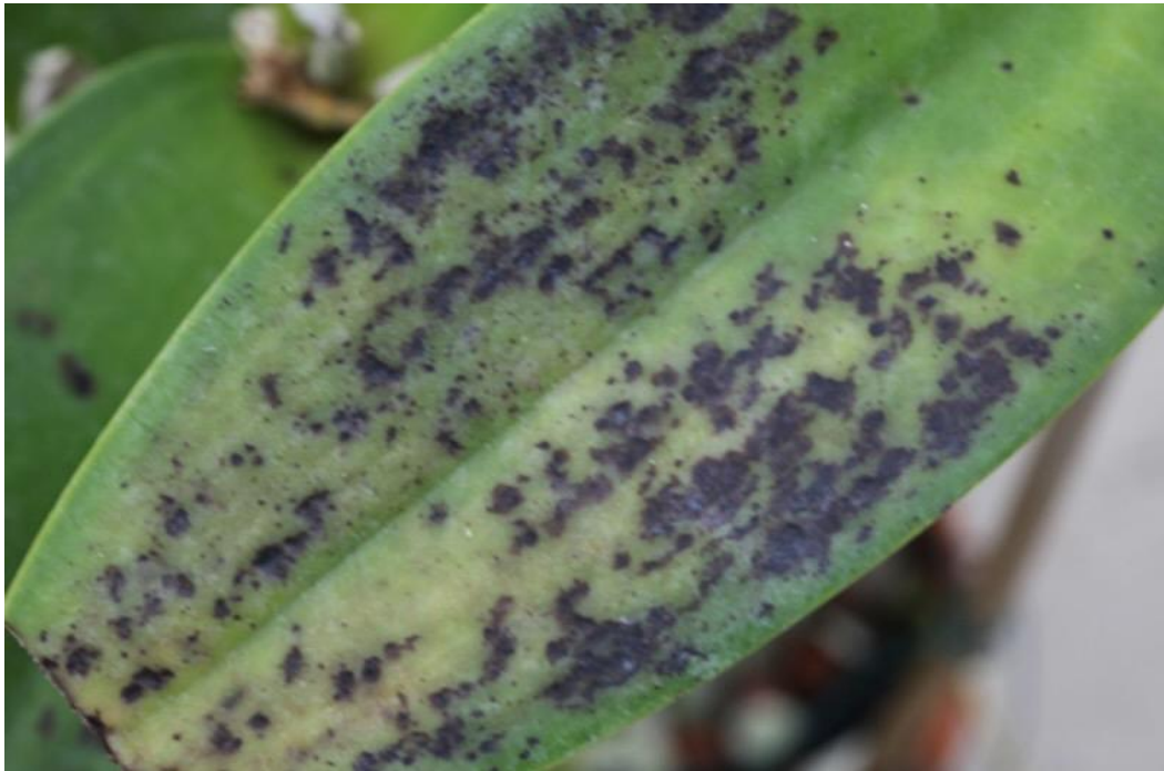
A leaf that, when tested, indicated this orchid had CymMV