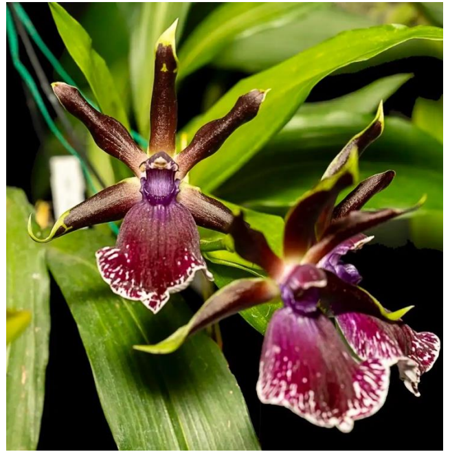
Zygopetalum Louisendorf 'Rhein Moonlight' grown by Desica Ingagiola