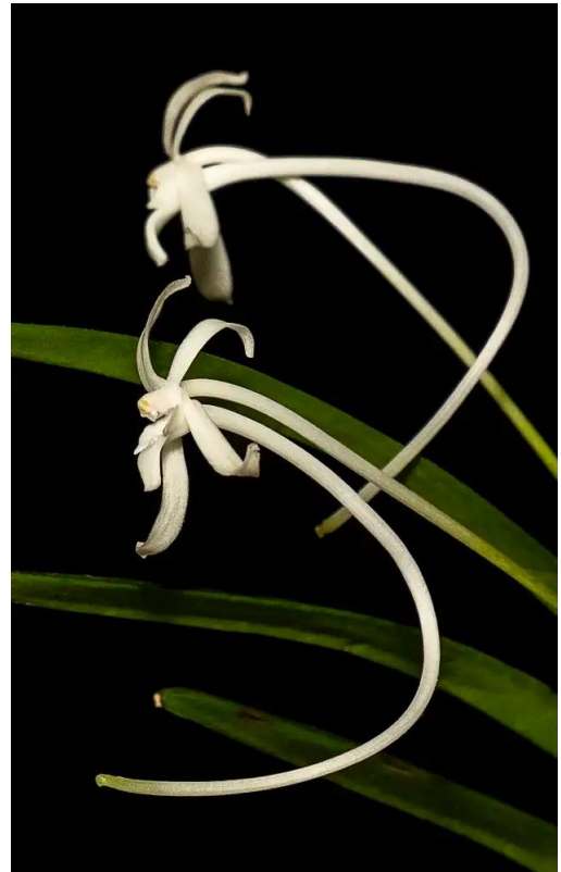
Neofinetia (Vanda) falcata 'Crystal Palace' grown by Elaine Murphy