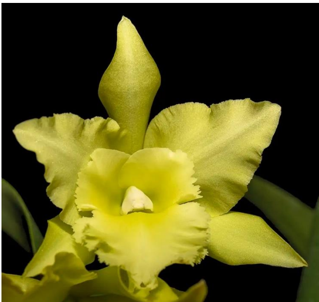
Blc. Port of Paradise 'Green Apple' grown by Una Yeh