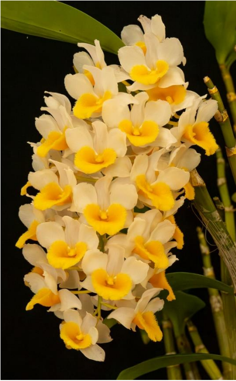
Dendrobium thrysiflorum , grown by Espie Quinn