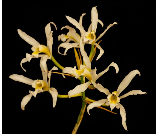
Laelia (Schomburgkia) superbiens, grown by Una Yeh