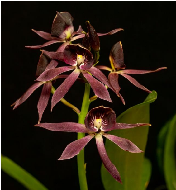
Guarechea Black Comet, grown by Una Yeh