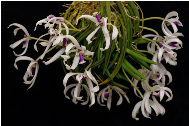
Leptotes bicolor, grown by Dean Shoffeitt