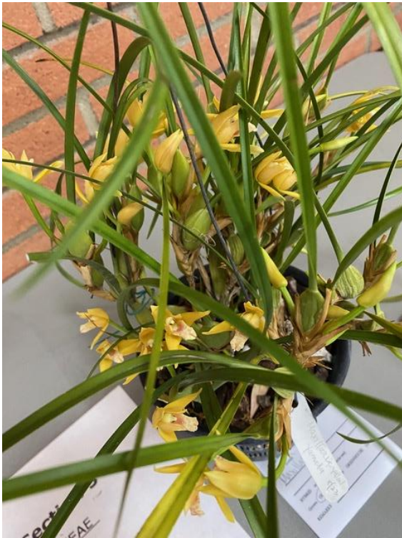
Maxillaria tenuifolia, yellow form, grown by Desica Ingagiola