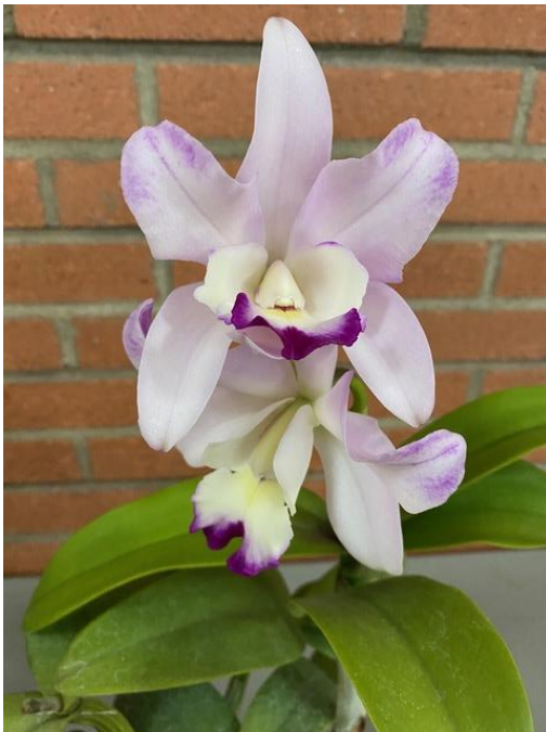
Lc. Pink Porcelain, grown by Desica Ingagiola