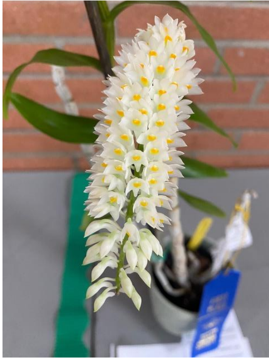
Dendrobium secundum , grown by Desica Ingagiola