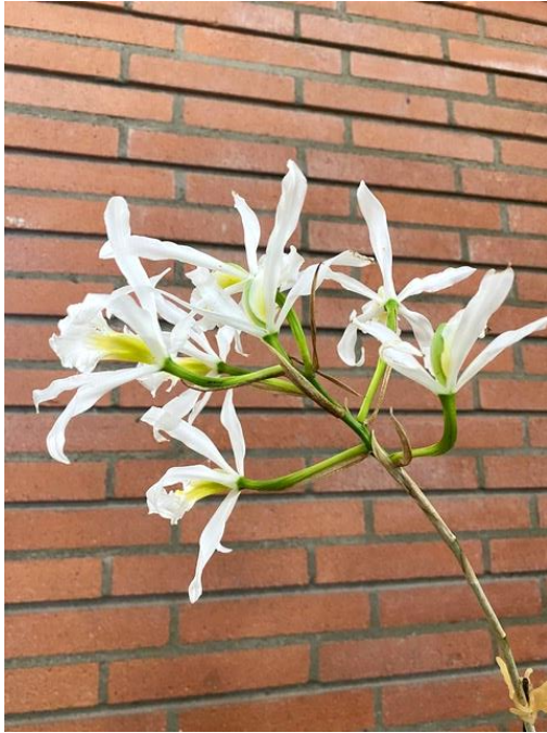
Laelia superbians alba , grown by Mong Noiboonsook

Many thanks to Mong Noiboonsook for the excellent photos.