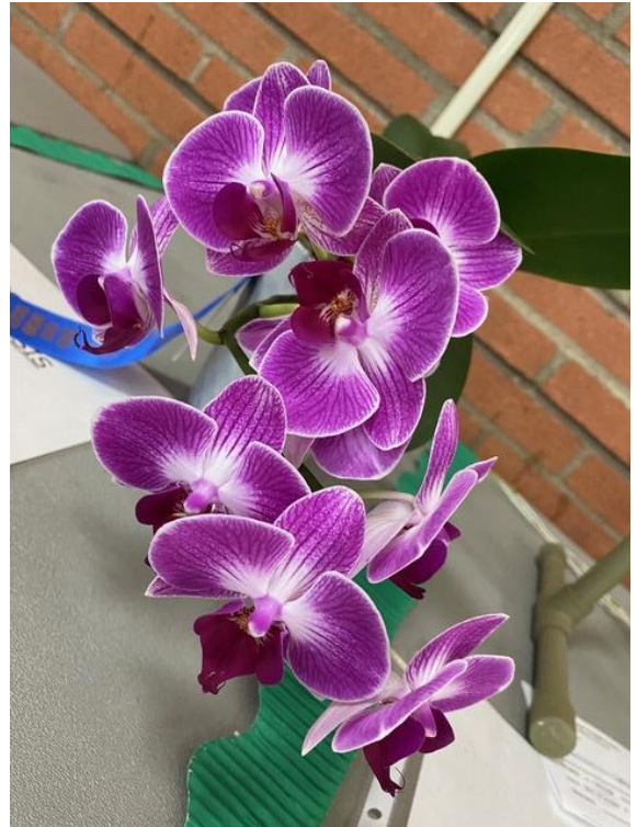
Phalaenopsis NOID, grown by Desica Ingagiola