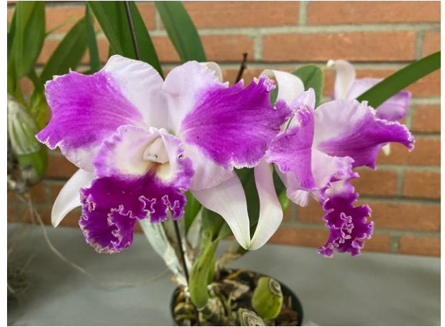
Cattleya NOID, grown by Desica Ingagiola