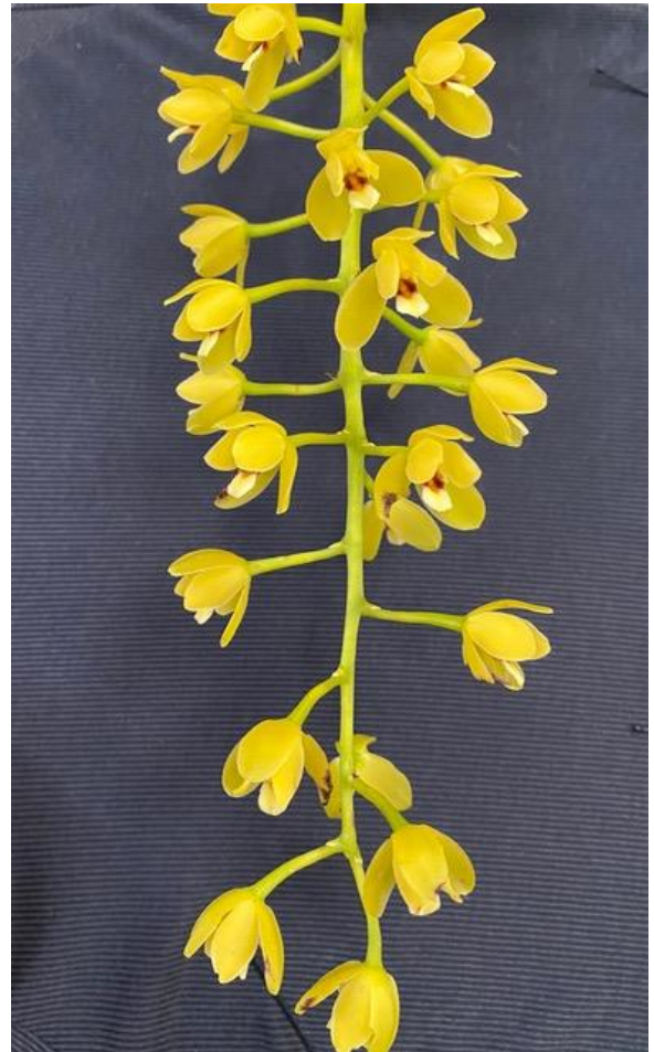
Cymbidium madidum 'Leroy', grown by Jill