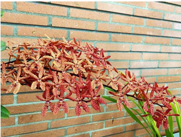
Renanthera monachica, grown by Desica Ingagiola